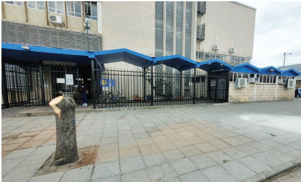
The club did a clean-up and revamp of Klerksdorp SAPS in the CBD. The building was painted, succulents were planted in multi-coloured tyres and the outside of the building received a facelift.