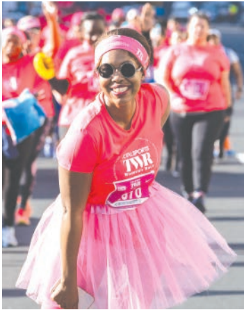
The Totalsports Women's Race in support of PinkDrive will take place on Wednesday 9 August.

Durban: Start at Masabalala Yengwa Ave and finish at Kings Park Athletics Track; Johannesburg: Start and finish at Marks Park, Emmerentia; Cape Town: Start and finish at Grand Parade, Cape Town, starting at 08:00. For more information on PinkDrive visit www.pinkdrive.co.za . For further information or to enter the Totalsports Women's Race visit www.totalsportswomensrace.co.za