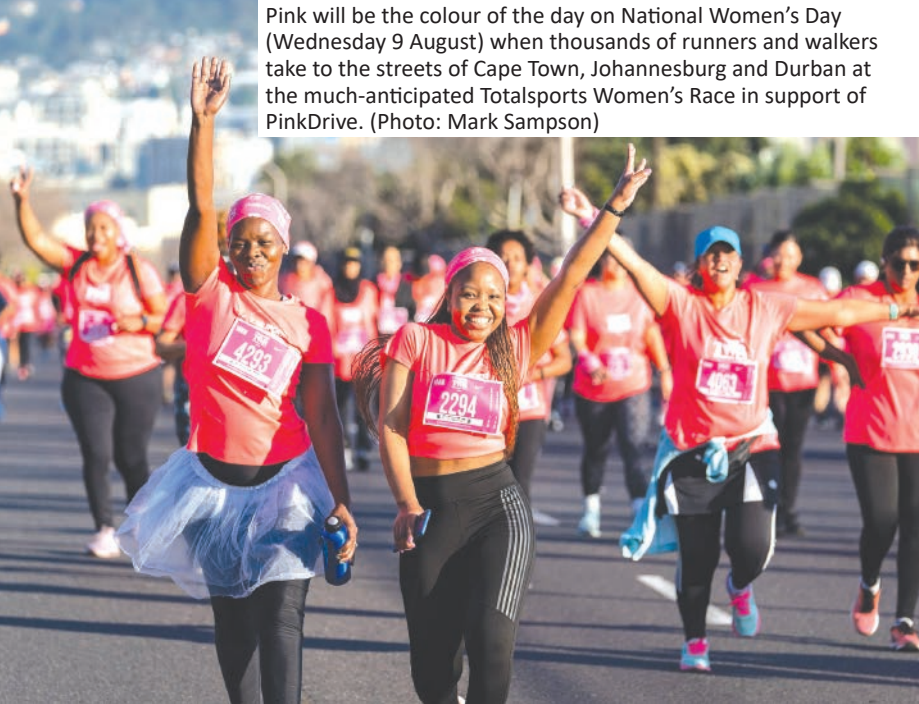
Pink will be the colour of the day on National Women's Day (Wednesday 9 August) when thousands of runners and walkers take to the streets of Cape Town, Johannesburg and Durban at the much-anticipated Totalsports Women's Race in support of PinkDrive.

BONUS - RUSTENBURG - Pink will be the colour of the day on National Women's Day (Wednesday 9 August) when thousands of runners and walkers take to the streets of Cape Town, Johannesburg and Durban at the much-anticipated Totalsports Women's Race in support of PinkDrive.