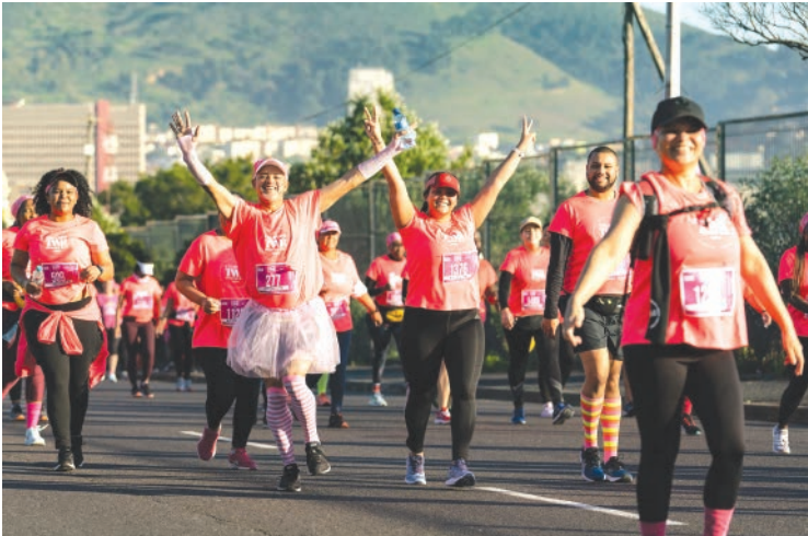
Runners and walkers enjoying the action of the Totalsports Women's Race in 2022.