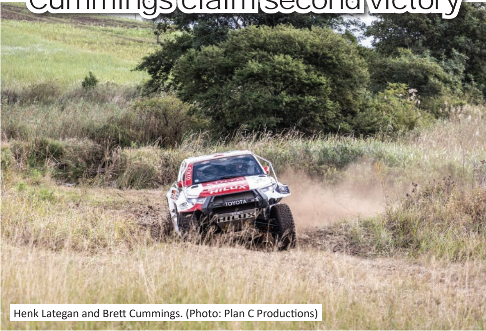
Henk Lategan and Brett Cummings.