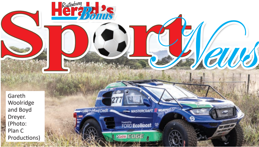
Gareth Woolridge and Boyd Dreyer.

- 1x toothbrush - 1x 250ml tube toothpaste - 1x 175g bath soap Registration closes on 26 May 2023 and can be done at: Office No.8 (Ground Floor), Rustenburg Local Municipality, Mpheni House, c/o Nelson Mandela and Bayers Naude Drive. Date for the event will be communicated in due course.