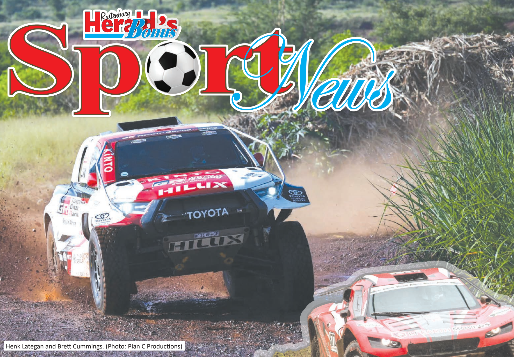
Henk Lategan and Brett Cummings.