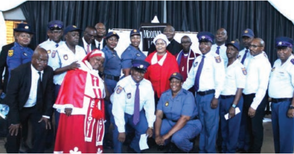
Rustenburg Police members took part in an Easter church service.