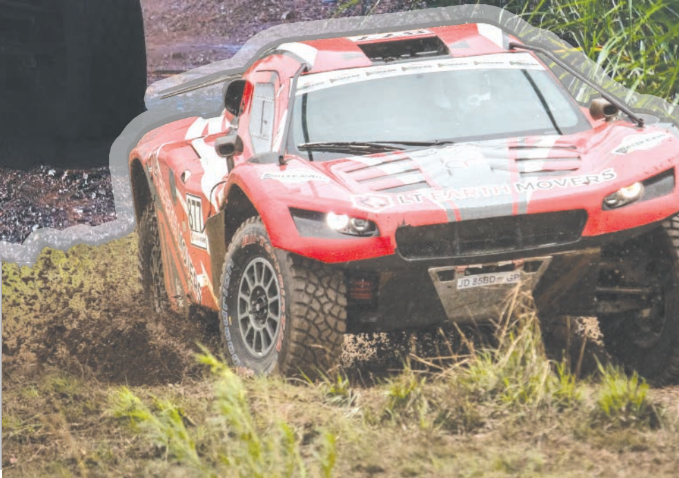
Lance Trethewey and Adriaan Roets.