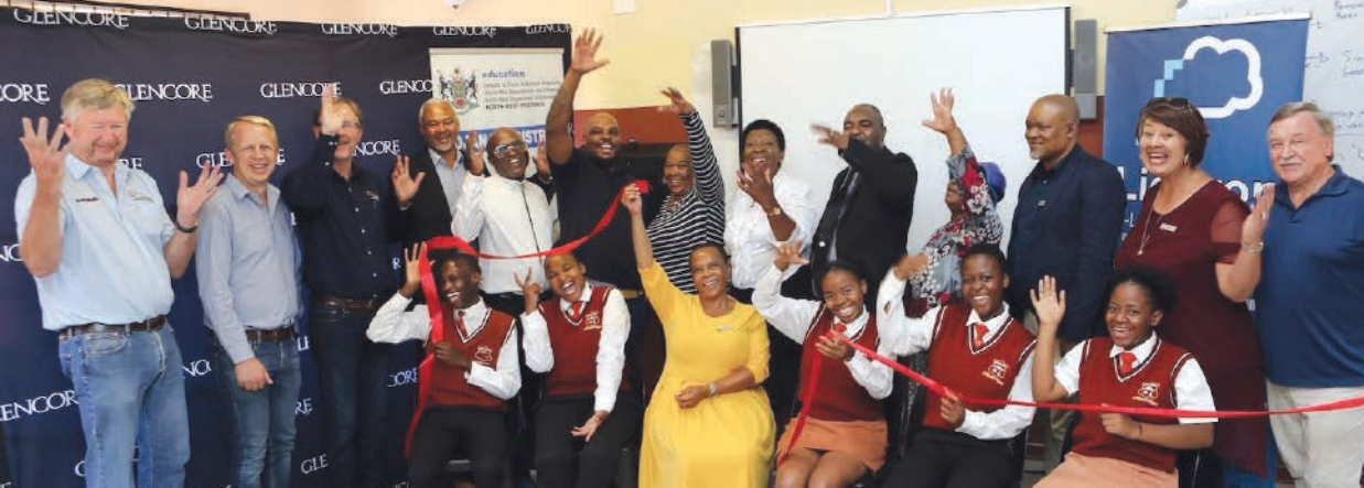
Glencore Ferroalloys representative, Ligbron representatives, Charora High school representatives and students of Charora High School at the ribbon cutting ceremony.

BONUS - RUSTENBURG - Mathematics and physical science are regarded as the two most crucial gateway subjects to take in high school as they can be key in setting up students for success, no matter which career path they choose.