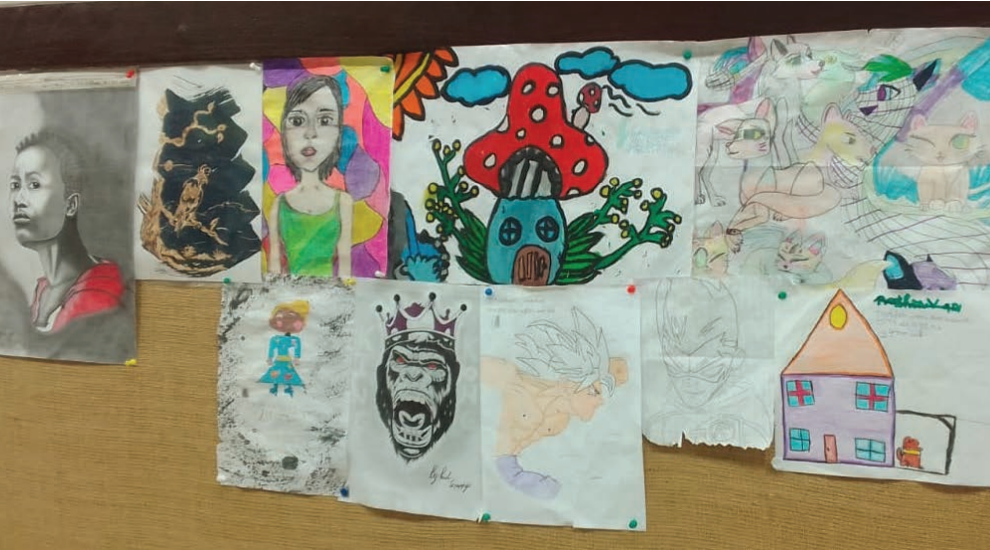
Once again the entries are pouring in for our Art competition.