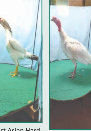
Best Turkey on show, British White male. owner Ewald Schulenburg.