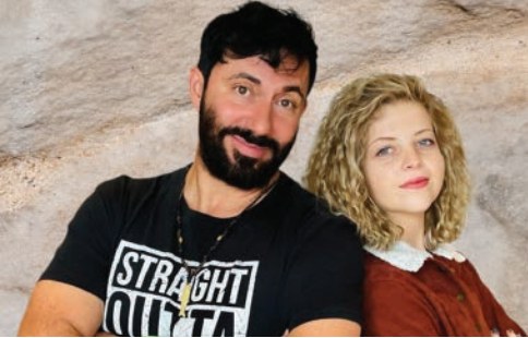
Jacaranda breakfast show host and popular musician, Martin Bester, as well as 'local lass' Bernice West will be performing at this year's Rustenburg Warm Fest, hosted again by the Waterfall Mall.

BONUS - RUSTENBURG - Many people love the winter. Snuggly sweaters, cozy blankets, drinking hot chocolate in mugs in front of the dancing flames in a fireplace. But what if your winter consists of sleeping outside, with barely anything to protect you from the cold? What if you are an organization trying your best to take care of more and more vulnerable people? Or an organization looking after abandoned or stray animals? To try and alleviate the enormous need for blankets the less fortunate and vulnerable, JacarandaFM initiated the Warm Fest. Popular breakfast show host, Martin Bester is the driving force of the festival. This year, Rustenburg will once again benefit from one of the Warm Fest performances. And, like last year, the Waterfall Mall will play host for the event. On Saturday (8 July), from 10:00 to morning some of the country's popular artist will do the entertaining, while you can just come and enjoy. You do not even have to have money to attend the concert! A donation of a warm blanket - or more than one, if you feel like it - is all that's required. The artists performing at the Rustenburg Warm Fest this year include Martin Bester, Bernice West, Samantha Leonard, Lungi, Wikus Botma, Min-Gespin and the very popular duo Droomsindroom. Make sure that you are there!