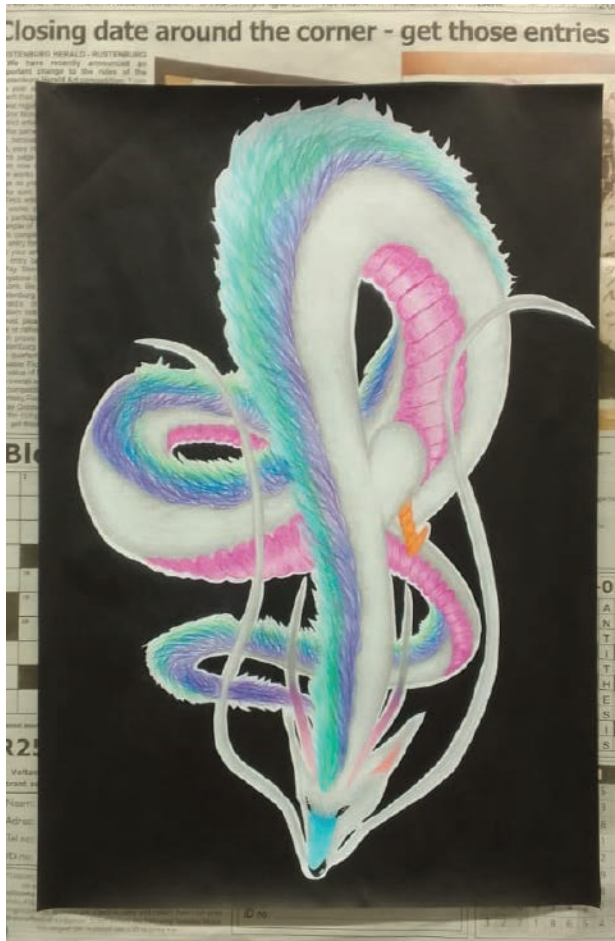
Remember that our Rustenburg Herald/Bonus art competition has no entry fee - “big money” is up for grabs!