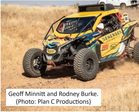
Geoff Minnitt and Rodney Burke.

kilometres and racing for a total of 11 hours, 14 minutes and 33 seconds (Woolridge/Dreyer), only three minutes 42 seconds separated them from their team-mates with both teams having a relatively clean run on the final day. They were joined on the podium by Guy Botterill/Simon Vacy-Lyle (Toyota DKR Hilux T1+) who started the final day from fourth position and arrived at the finish with a broken windscreen after hitting a vulture shortly after starting the second of the two 213 kilometre loops. Botterill/Vacy-Lyle