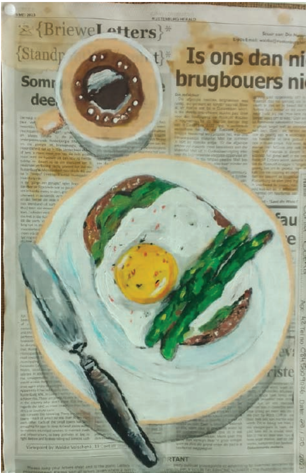
Does this make you hungry? An entry by another talented artist in our Rustenburg Herald/Bonus Art competition.

BONUS - RUSTENBURG - With our latest “batch” of winners in our Rustenburg Herald/Bonus Art competition announced, it is very likely that there may be more artists who feel that they could benefit from a cash prize of R1 000 not the mention a Pick n Pay shopping voucher to the value of R10 000 which will be awarded in the final round at the end of the year. Good news for these artists is that the new Art competition will officially kick off on Monday, 3 July. To enter - remember the following: Look for the entry form printed in every week’s edition of Rustenburg Herald. Complete this and attach it to your artwork which could be any full page in Rustenburg Herald provided that the name of the publication and the date are clearly visible. You are welcome to paint the full page with a base colour in white, black or any colour your prefer and to work on the base coat to complete your artwork. You may enter as many artworks as you wish and there is no entry fee. Keep watching Rustenburg Herald and Bonus for regular news and/or updates on the competition. You can “post” your entries in the entry boxes at the two Pick n Pay stores which are clearly marked “Art competition” at the art display boards in both Pick n Pay stores. The closing date will be announced at a much later stage. Good luck with your entries.