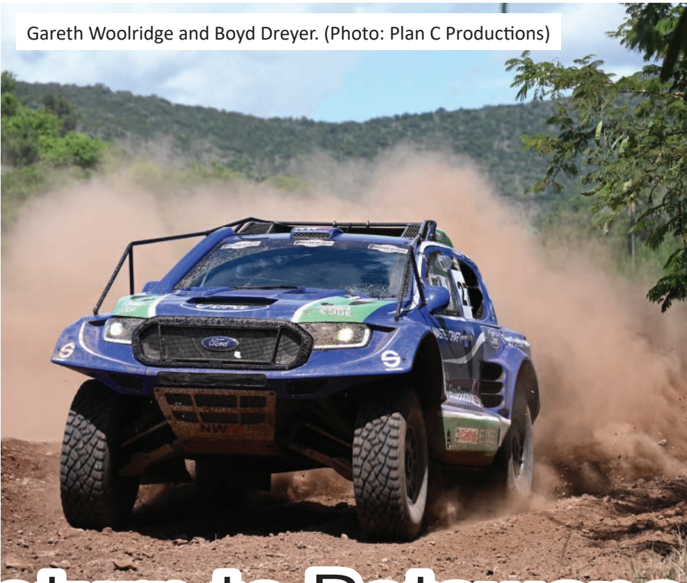
Gareth Woolridge and Boyd Dreyer.