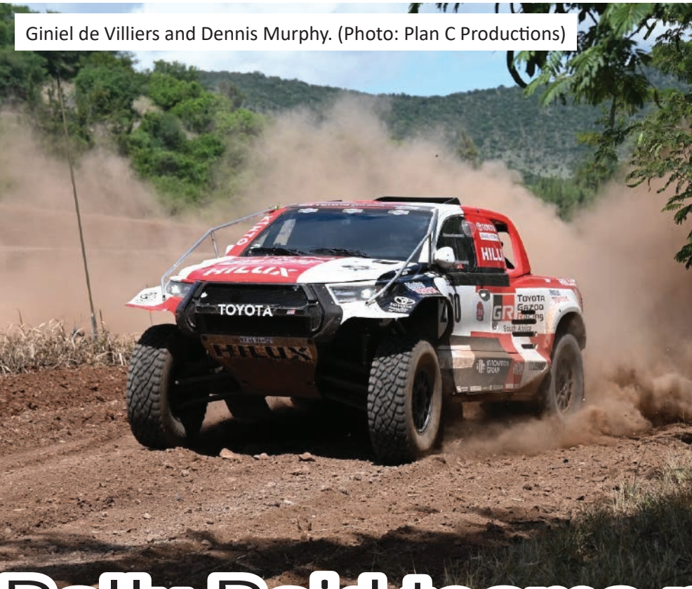
Giniel de Villiers and Dennis Murphy.