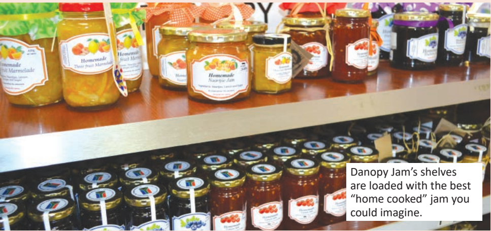
Danopy Jam's shelves are loaded with the best “home cooked” jam you could imagine.