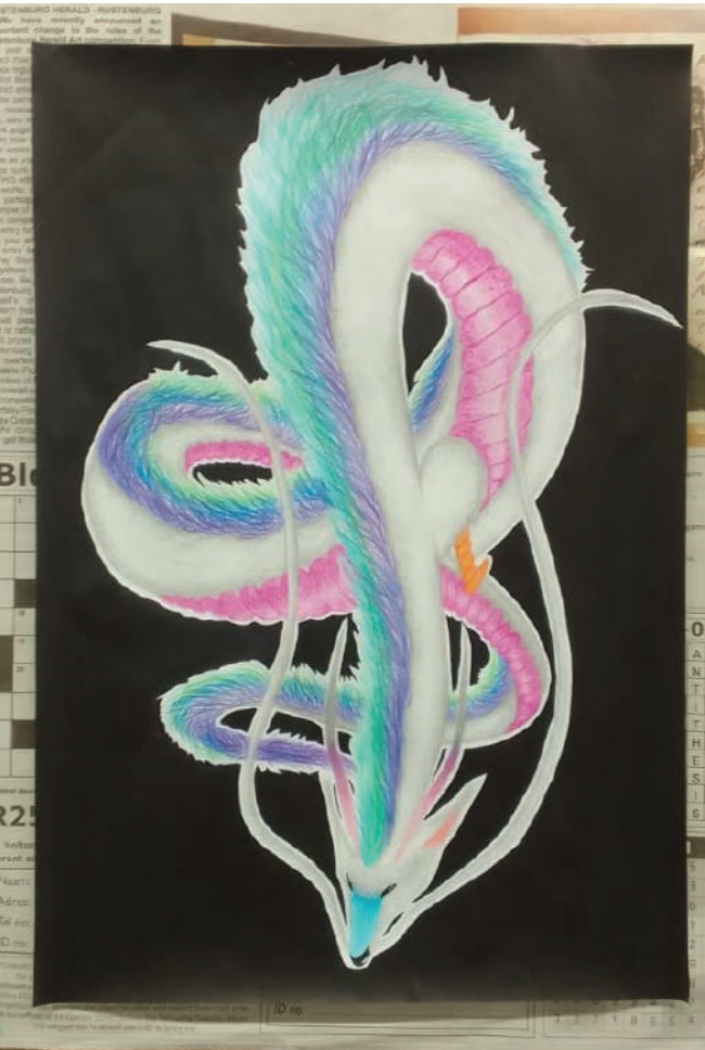
Remember that our Rustenburg Herald/Bonus art competition has no entry fee - “big money” is up for grabs!

BONUS - RUSTENBURG - With our latest “batch” of winners in our Rustenburg Herald/Bonus Art competition announced, it is very likely that there may be more artists who may feel that they could benefit from a cash prize of R1 000 not the mention a Pick n Pay shopping voucher to the value of R10 000 which will be awarded in the final round of the competition towards the end of this year. Good news for these artists is that the new Art competition had officially kicked off on Monday this week (3 July). To enter - remember the following: Look for the entry form printed in every week’s edition of Rustenburg Herald. Complete this and attach it to your artwork which could be any full page in Rustenburg Herald provided that the name of the publication and the date are clearly visible. You are welcome to paint the full page with a base colour in white, black or any colour your prefer and to work on the base coat to complete your artwork. You may enter as many artworks as you wish and there is no entry fee. Keep watching Rustenburg Herald and Bonus for regular news and/or updates on the competition. You can “post” your entries in the entry boxes at the two Pick n Pay stores which are clearly marked “Art competition” at the art display boards in both Pick n Pay stores. The closing date will be announced at a much later stage. Good luck with your entries.