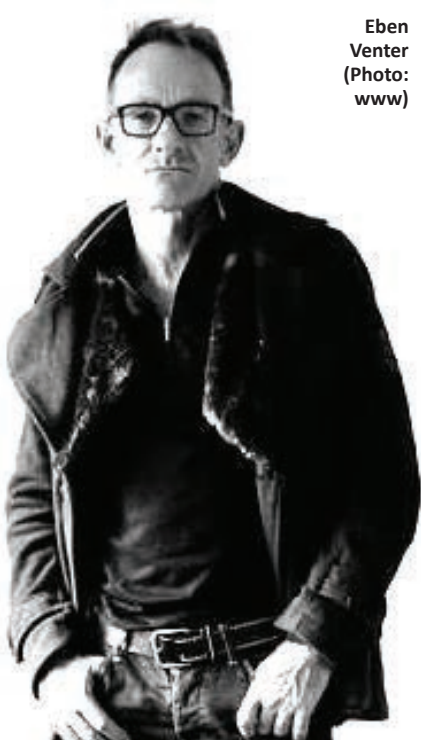
Eben Venter

I f it was possible for a wild animal to be able to tell their own tales and to write their own history, what would they say? Would you be touched by their hopes and fears and trauma if you could hear it in their own words? With Decima, the highly acclaimed author Eben Venter successfully attempts to open the door, to break down the barrier and give you passage to the heart of a beast. Decima is a imposing black rhino cow. Her daughter, Tandeka is awaiting the birth of her calf and the small rhino community is looking forward to the arrival of this baby in the spring. But with the rise of every full moon, Decima’s fear grows as she recalls the terrible night, many seasons ago, that left her an orphan. The story is one for many voices and tells of the impact poachers, their clients and traditional medicine have on the lives of this group of rhinos. It also tells of the impact these circumstances have on the people tasked with keeping rhinos safe. Venter skillfully navigates and intertwines the tale of Decima with his own and that of his delicate mother. Decima combines auto fiction, fable, crime and science to bring a compelling plea to take care of this giants, told in a way that can only be called poetic. Decima is published in English and Afrikaans by Penguin Random House SA. Decima combines auto fiction, fable, crime and science to bring a compelling plea to take care of this giants, told in a way that can only be called poetic.