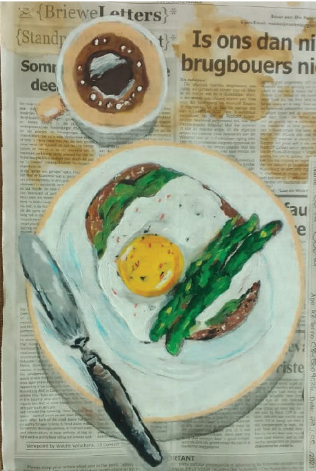
Does this make you hungry? An entry by another talented artist in our Rustenburg Herald/Bonus Art competition.

BONUS - RUSTENBURG - With our latest “batch” of winners in our Rustenburg Herald/Bonus Art competition announced, it is very likely that there may be more artists who may feel that they could benefit from a cash prize of R1 000 not the mention a Pick n Pay shopping voucher to the value of R10 000 which will be awarded in the final round of the competition towards the end of this year. Good news for these artists is that the new Art competition had officially kicked off on Monday this week (3 July). To enter - remember the following: Look for the entry form printed in every week’s edition of Rustenburg Herald. Complete this and attach it to your artwork which could be any full page in Rustenburg Herald provided that the name of the publication and the date are clearly visible. You are welcome to paint the full page with a base colour in white, black or any colour your prefer and to work on the base coat to complete your artwork. You may enter as many artworks as you wish and there is no entry fee. Keep watching Rustenburg Herald and Bonus for regular news and/or updates on the competition. You can “post” your entries in the entry boxes at the two Pick n Pay stores which are clearly marked “Art competition” at the art display boards in both Pick n Pay stores. The closing date will be announced at a much later stage. Good luck with your entries.