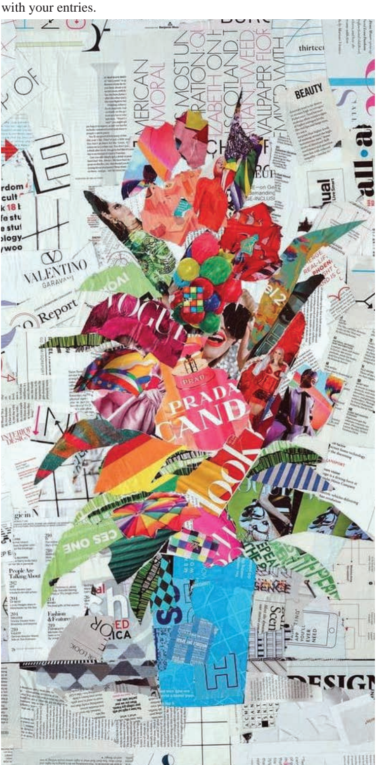
Making art out of bits and pieces of paper could have you featuring in our art competition. Are you up for it?

You may enter as many artworks as you wish and there is no entry fee. Keep watching Rustenburg Herald and Bonus for regular news and/or updates on the competition. You can "post" your entries in the entry boxes at the two Pick n Pay stores which are clearly marked "Art competition" at the art display boards in both Pick n Pay stores. The closing date will be announced at a much later stage. Good luck with your entries.