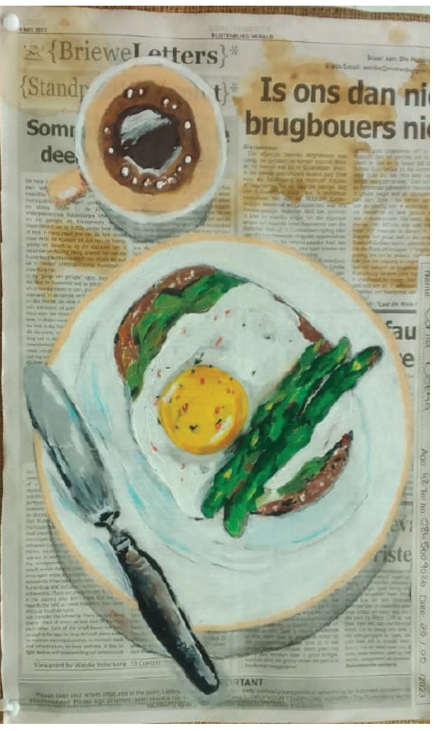
An entry by another talented artist in our Rustenburg Herald/Bonus Art competition.