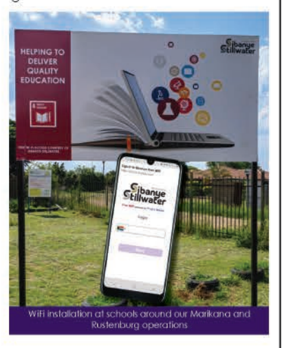
Sibanye-Stillwater - creating superior shared value

The cadetship programme is designed to provide skills development for unemployed youth in communities surrounding Sibanye-Stillwater's operations. They are provided with basic skills required to be eligible for employment at entry-level job categories of mining and metallurgy. Over R31 million has been spent towards 2,806