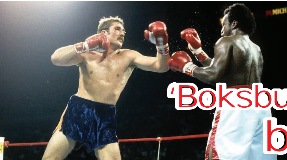
Gerrie Coetzee throws a left punch against Michael Dokes during the fight at the Richfield Coliseum in Richfield, Ohio. Coetzee won the WBA World Heavyweight Title by a Knock Out (KO) in the 10th round.