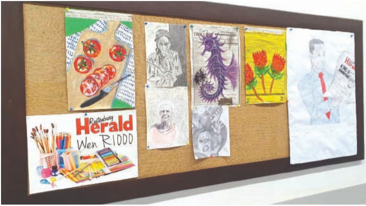
The entries at Pick n Pay Greystone Crossing.