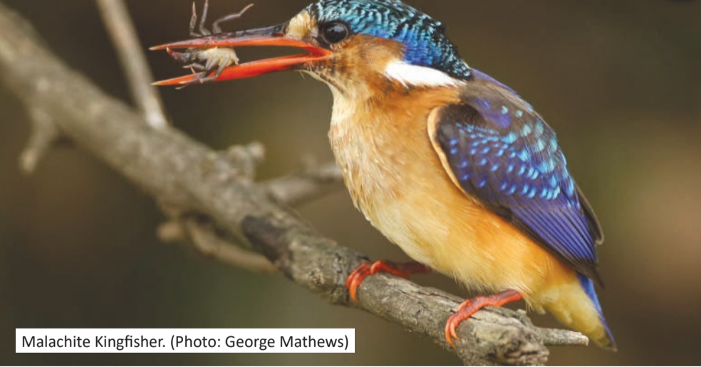
Malachite Kingfisher.

BONUS - RUSTENBURG - Birdlife Rustenburg: Kingfishers are fascinating small to medium-sized birds with long, dagger-like bills.