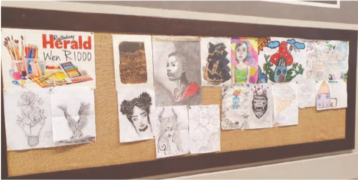
Our display boards at Pick n Pay, Beyers Naudé.