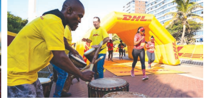
The DHL Mile To Go does a great job motivating runners until they reach the finish line.

PRINTED BY NORTH WEST WEB PRINTERS (PTY) LTD. TEL: 014-592 8329