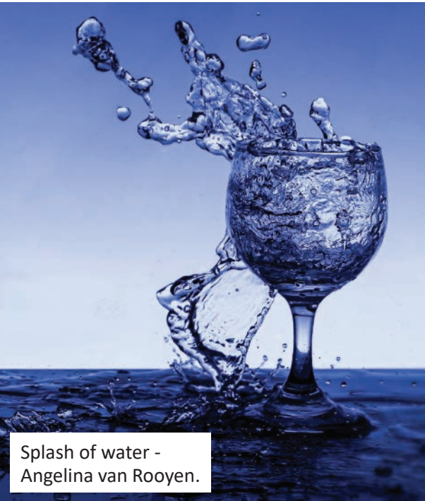
Splash of water - Angelina van Rooyen.