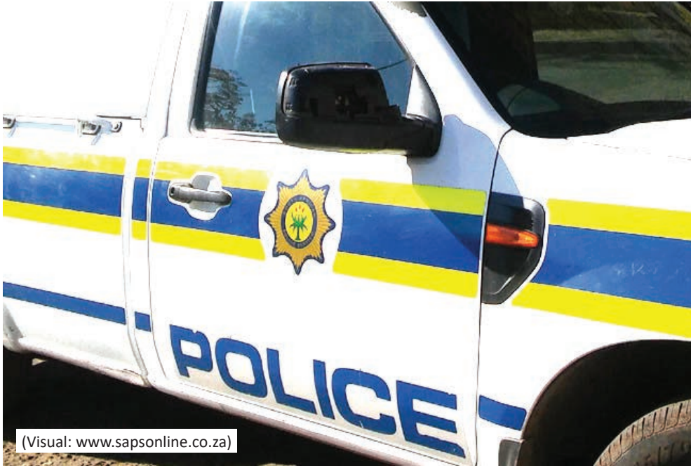
(Visual: www.sapsonline.co.za )

BONUS - RUSTENBURG - A suspected robber was shot, while three others were arrested after a shootout with police in the early hours of Friday (23 September).