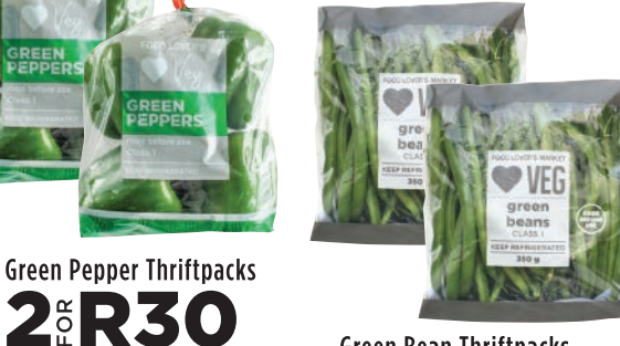
Green Bean Thriftpacks