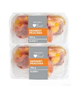
New Season Peach Punnets 2¤R50