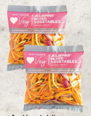
Food Lover's Julienne Mixed Vegetable Bags 375 g 99