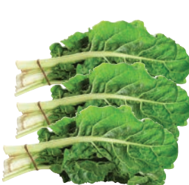
Spinach Bunches 3:R25