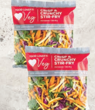
Food Lover's Crisp & Crunchy Stir-fry Bags 375 g 99

Green Beans 170 g, Sliced Peppers 150 g, Diced Carrots 180 g, Diced Peppers 180 g, Onion Rings 130 g, Carrot Cauliflower Microwave Bags 500 g Spirals 130 g