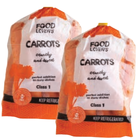
Carrot Thriftpacks 1 kg Potjie Potato Thriftpacks 1 kg 25R25