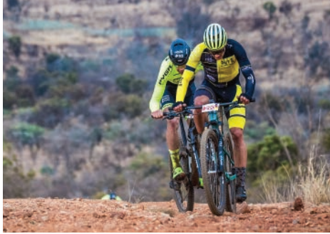
Mountain bikers enjoying the action at the 2021 Fedhealth Magalies Monster MTB Classic.

For more information and/or to enter the Fedhealth Magalies Monster MTB Classic visit www.stillwatersports.com or email entries@stillwatersports.com .