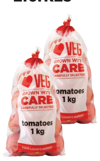
Tomato Thriftpack 1 kg 2forR25