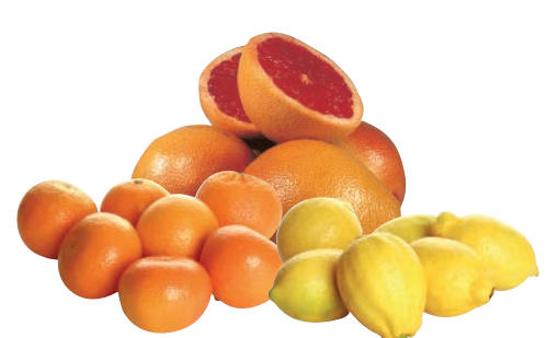
Naartjies, Lemons or Star Ruby Grapefruit 9.99 per kg