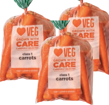
Carrot Thriftpack 1 kg 3forR25