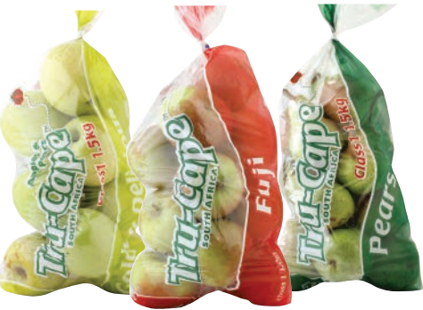
Apple & Pear Econopacks Assorted 1.5 kg 19.99each