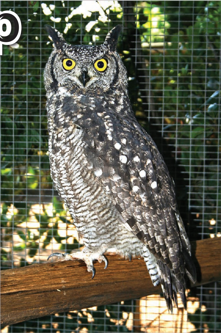
The Spotted Eagle Owl was a recent patient of the ‘We Care’ rehabilitation centre.