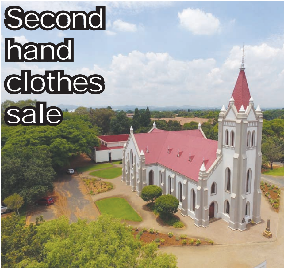
Second hand clothes sale on Friday 1 July 2022, from 07:30 – 11:00 at the Dutch Reformed Church, corner of Beyers Naude & Fatima Bhayat Streets.