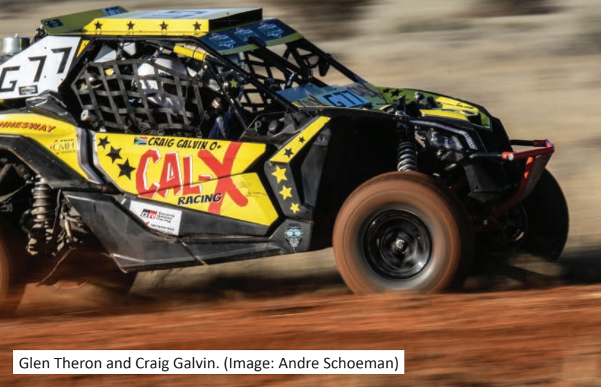
Glen Theron and Craig Galvin.

BONUS - RUSTENBURG - The chase in the Special Vehicle Category of the Toyota Gazoo Racing (TGRSA) 1000 Desert Race, the second round of the SA Rally-Raid Championship that took place from 24 to 26 June at Upington, continued on Day Two and with almost 550 kilometres something of the past, not much separates the two leading teams. Former champions, Tim Howes/Gary Campbell (Tim Drew Properties BAT Spec 4) started Day Two leading Class A as well as the category overall with only five minutes and 12 seconds separating them from Trace Price Moor/Shawn Braithwaite (Tip Top Milk BAT Venom). A ding-dong battle ensued on Day Two with Howes/Campbell losing their lead temporarily during the first of the two loops when their vehicle ended up on its roof. After being helped onto its wheels by fellow competitors, the team regained their lead and continue on a clean run. The gap has, however, shrunk to a mere four minutes and five seconds.