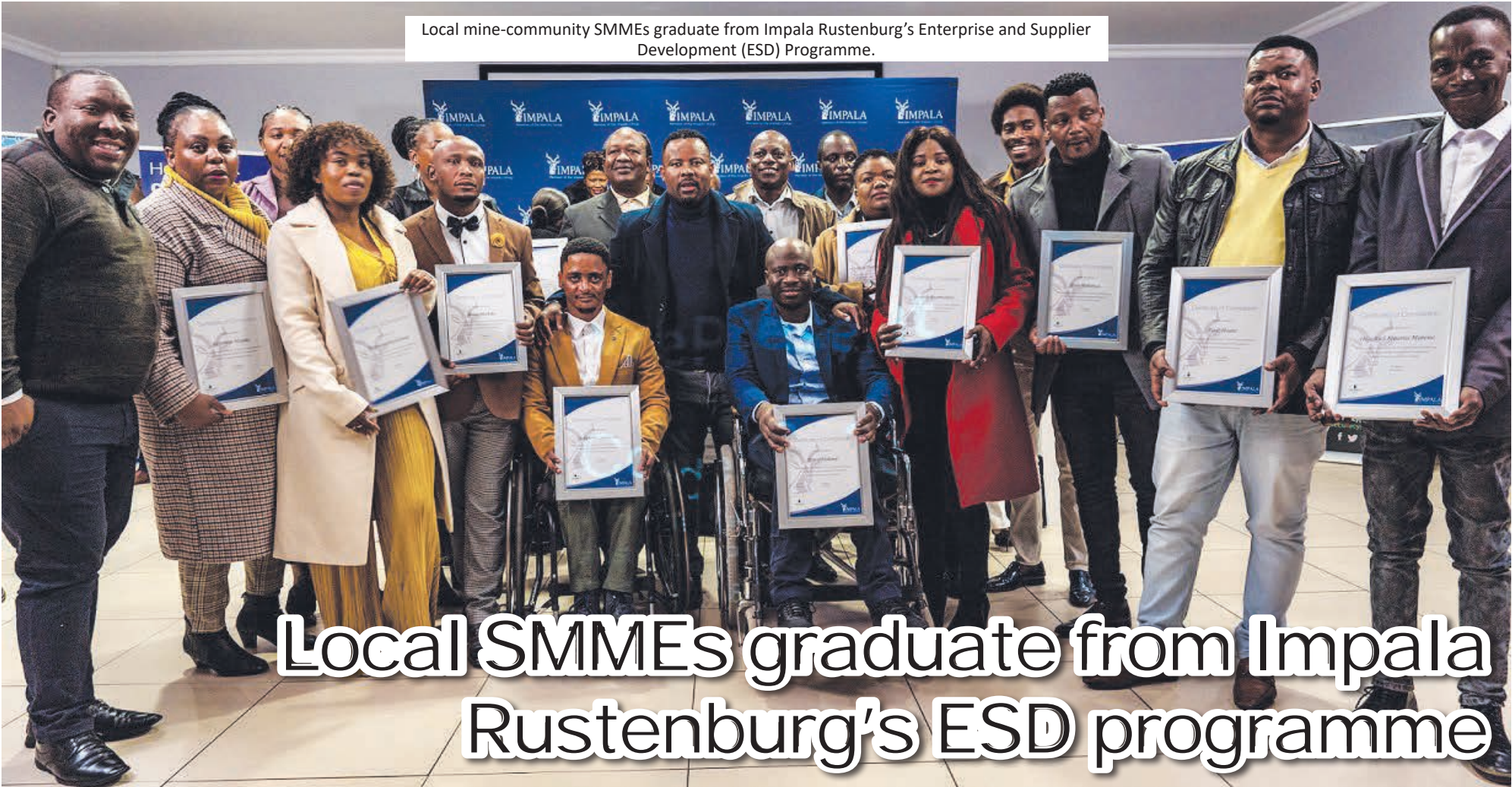
Local mine-community SMMEs graduate from Impala Rustenburg’s Enterprise and Supplier Development (ESD) Programme.