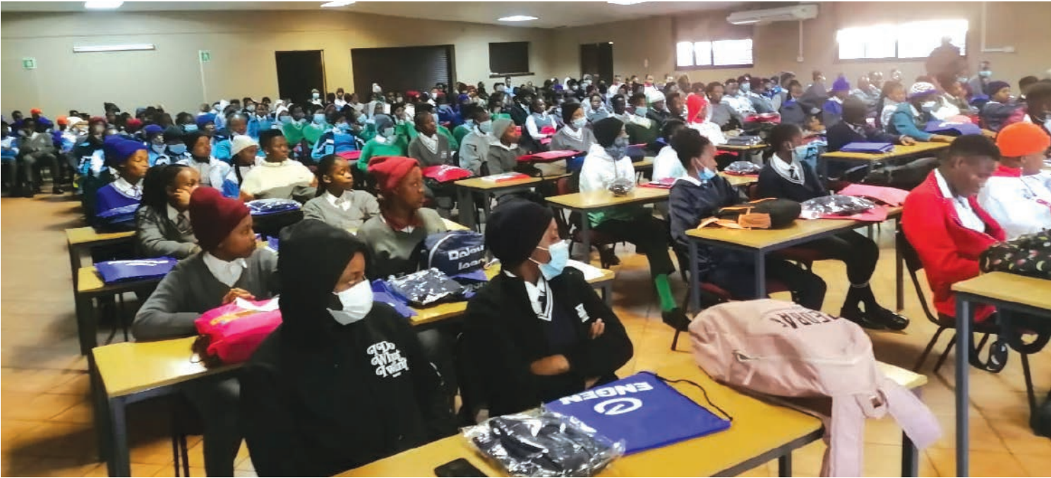
Matric learners from 15 schools in the Bakgatla area attended an intensive bootcamp thanks to Engen and Siyanda Platinum Mines.

In 2021, Engen invested R11.9 million in Learnerships and Bursaries, whilst also continuing to provide free supplementary Maths, Science and Technology tuition to approximately 1 800 under-privileged Grade 10-12 learners across South Africa through the Engen Maths and Science (EMSS) School programme.