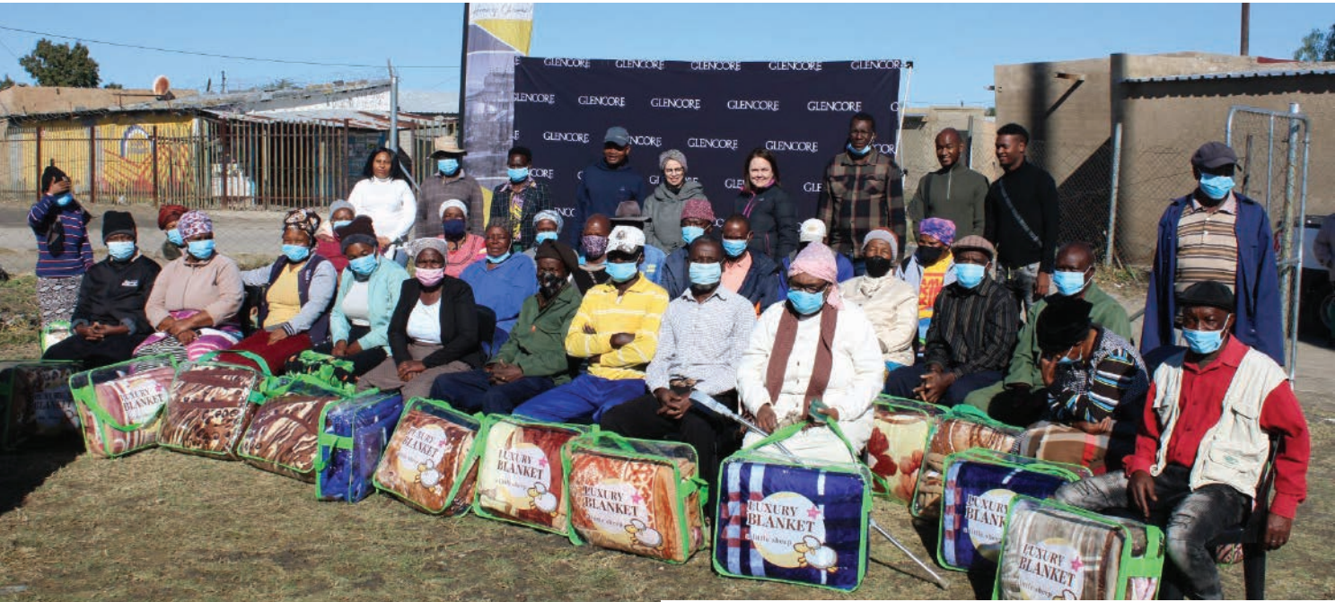
Wonderkop Smelter Winter drive.