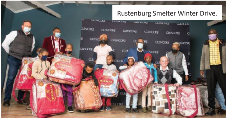
Rustenburg Smelter Winter Drive.