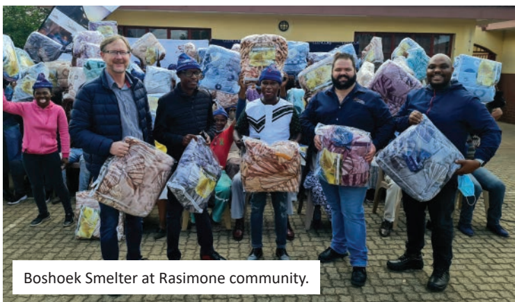
Boshhoek Smelter at Rasimone community.