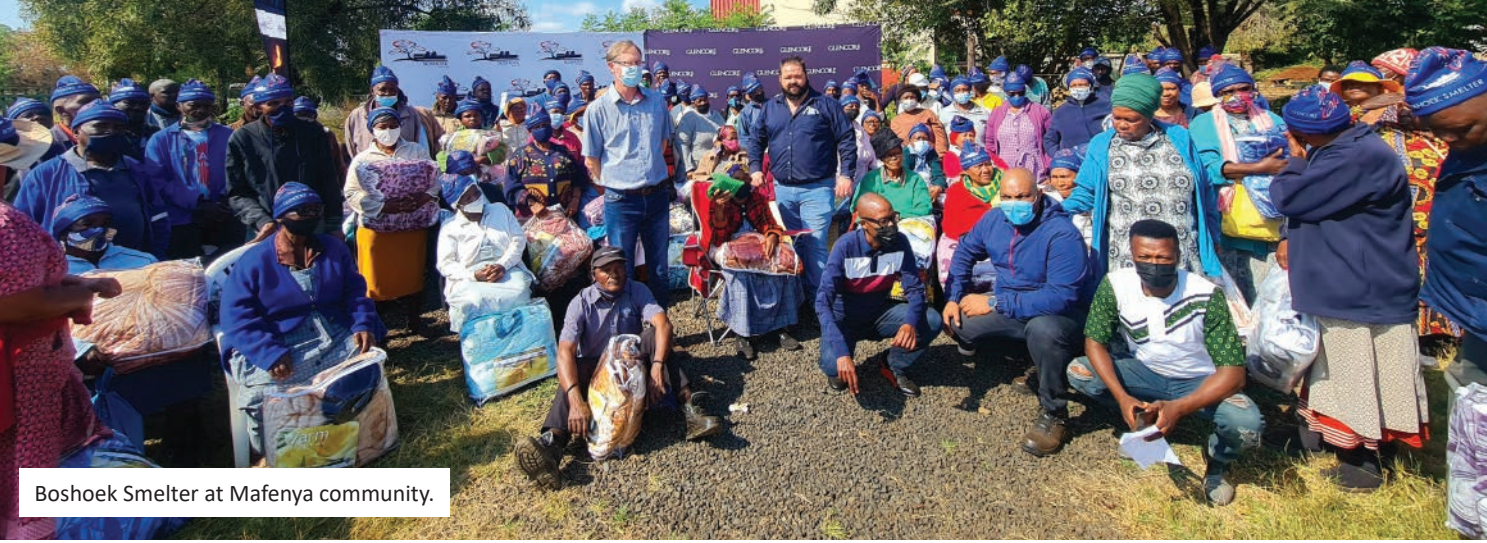
Boshhoek Smelter at Mafenya community.

Glencore hopes that through this support and many others, it can further improve the quality of life as it progresses together with the communities near its operations.