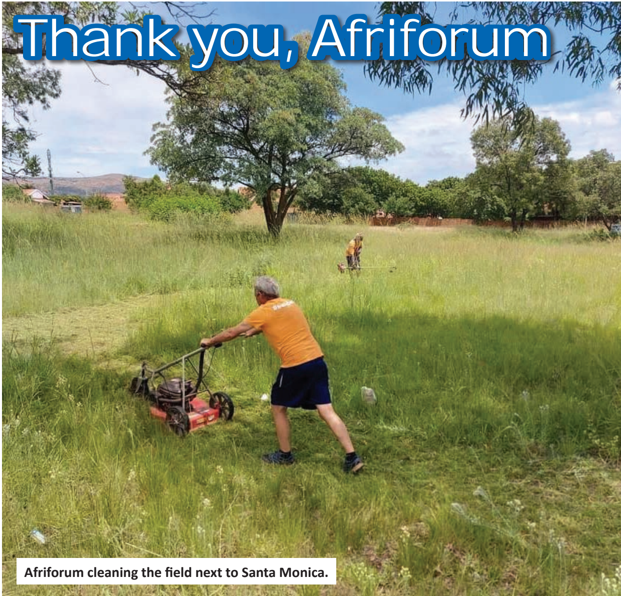
Afriforum cleaning the field next to Santa Monica.