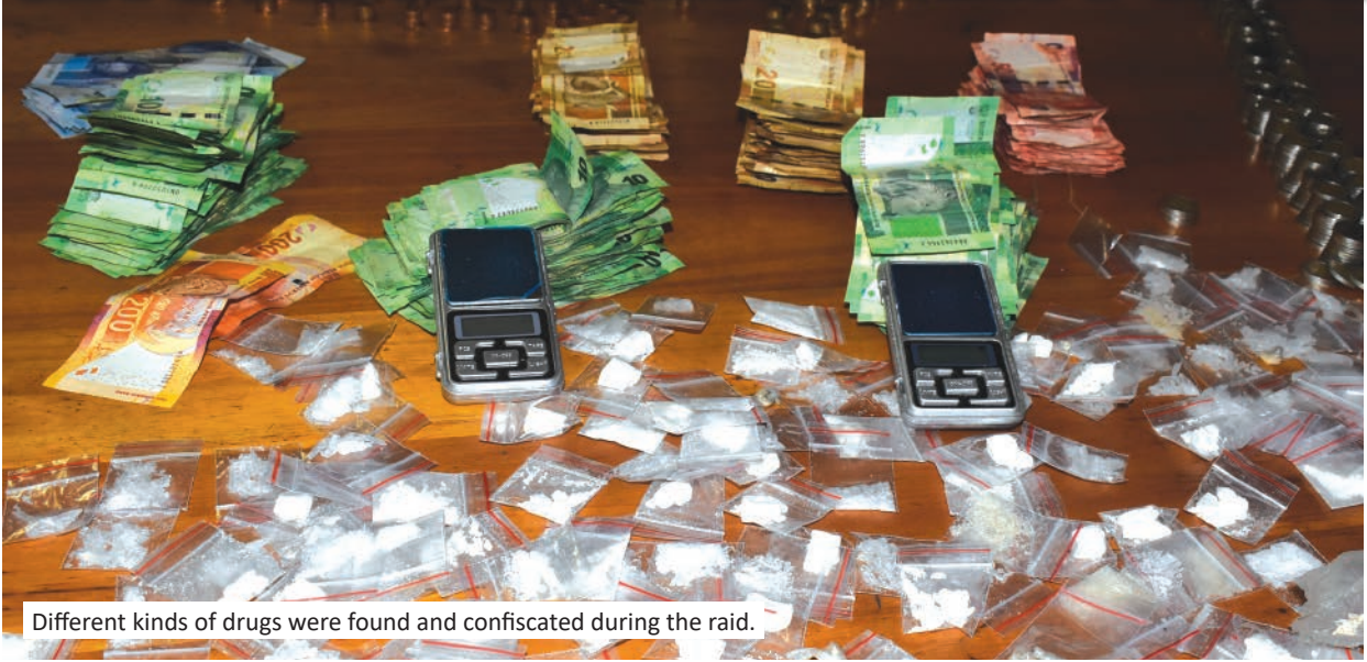
Different kinds of drugs were found and confiscated during the raid.

RUSTENBURG HERALD - RUSTENBURG – An intelligence driven operation by the K9 unit, Public Order Police (POP) and Rapid Railway Police Unit (RRPU) on detachment duties and led by Left/Col Keamogetse Tube of the Phokeng K9 Unit has led to the arrest of several suspects for possession and dealing with drugs.