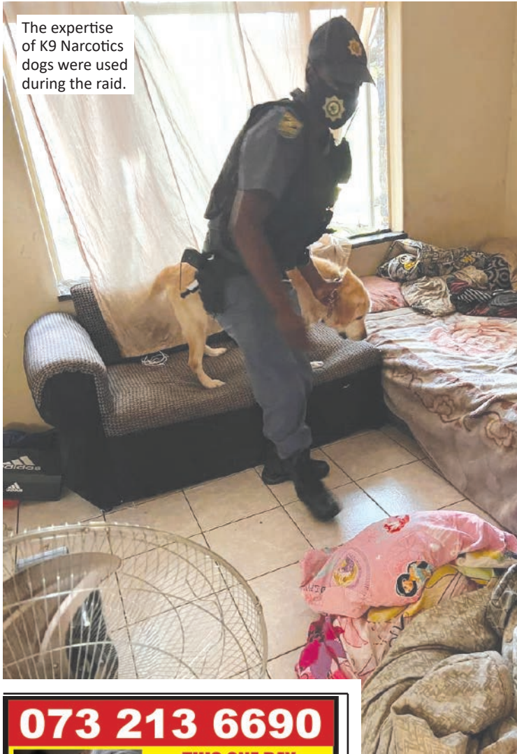
The expertise of K9 Narcotics dogs were used during the raid.