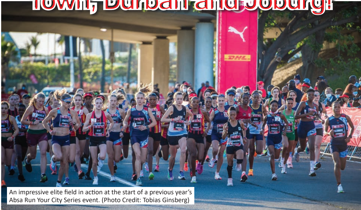
An impressive elite field in action at the start of a previous year's Absa Run Your City Series event.