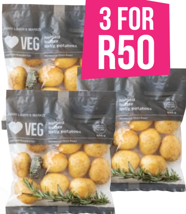
Herbed Butter Baby Potatoes 600 g