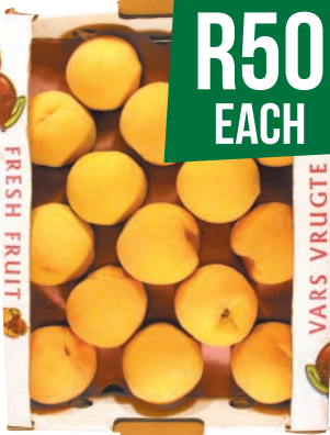
Yellow Cling Peach Boxes