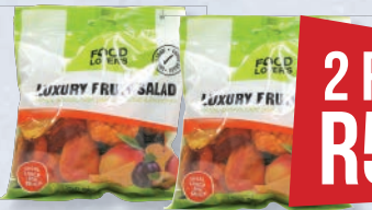
Food Lover's Luxury Fruit Salad 250 g