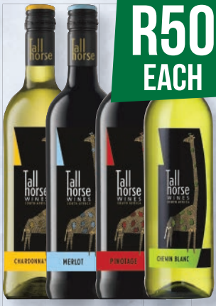
Tall Horse Wine Assorted 750 ml