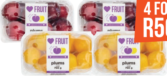
Yellow or Red Plum Punnets