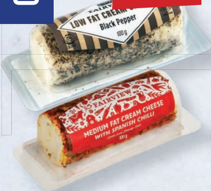
Fairview Cream Cheese Assorted 100 g