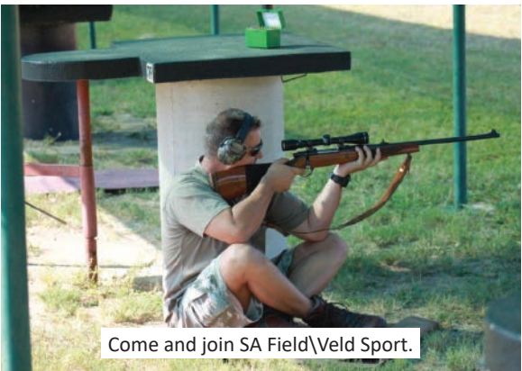
Come and join SA Field\Veld Sport.

of only a few ranges, where facilities includes; Bow-, Handgun-, Airgun-, Air Pistol-, Rimfire-, Centre Fire- (to 900m), Big Bore-, and Shotgun ranges. The range also sports a “Bush lane” where tactical exercises are done. Waterval Shooting range has a cafeteria, swimming pool and braai facilities, where shooters and their families can spend some quiet time after a shoot, in the countryside. Visitors pay R150 to use the range during the week or on Saturdays, but members do not pay range fees. Two Hunting competitions are arranged annually, for members who qualify. The sought after “Top Hunter” award is made to one participant during these events annually”. The friendly Melani and Daleen, are waiting for your call at the SAFS office, tel 078 968 6451, or you may visit them at the office, 64 Boomstreet Rustenburg, between 07:00 and 16:00 Monday to Thursdays. You may also apply for membership directly on the web site at www.safieldsport.org .