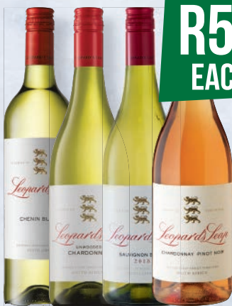
Leopard's Leap Assorted 750 ml