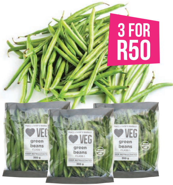
Green Bean Thriftpacks