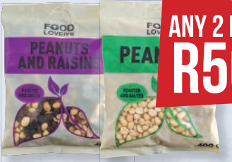
Food Lover's Roasted & Salted Peanuts or Peanuts & Raisins 400 g