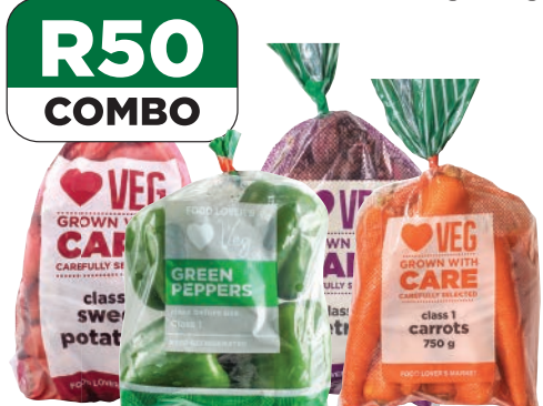
1 x Carrot Thriftpack 1 kg