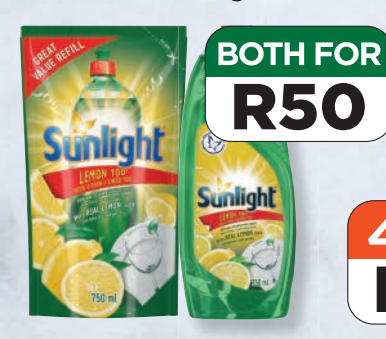
COMBO: 1 x Sunlight Regular Dishwashing Liquid 750 ml & 1 x Sunlight Refill 750 ml