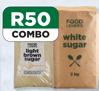
COMBO: 1 x Food Lover's White Sugar 2 kg & 1 x Food Lover's Light Brown Sugar 1 kg