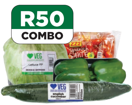
1 x Lettuce Prepack 1 x English Cucumber 1 x Green Pepper 2's