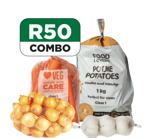
1 x Carrot Thriftpack 1 kg