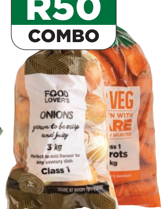
1 x Onion Bag 3 kg 1 x Carrot Bag 3 kg