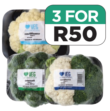
Broccoli, Caulibroc or Cauliflower Prepacks