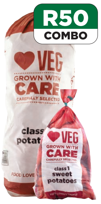
1 x Potato Pocket 7 kg 1 x Sweet Potato Carry Pocket