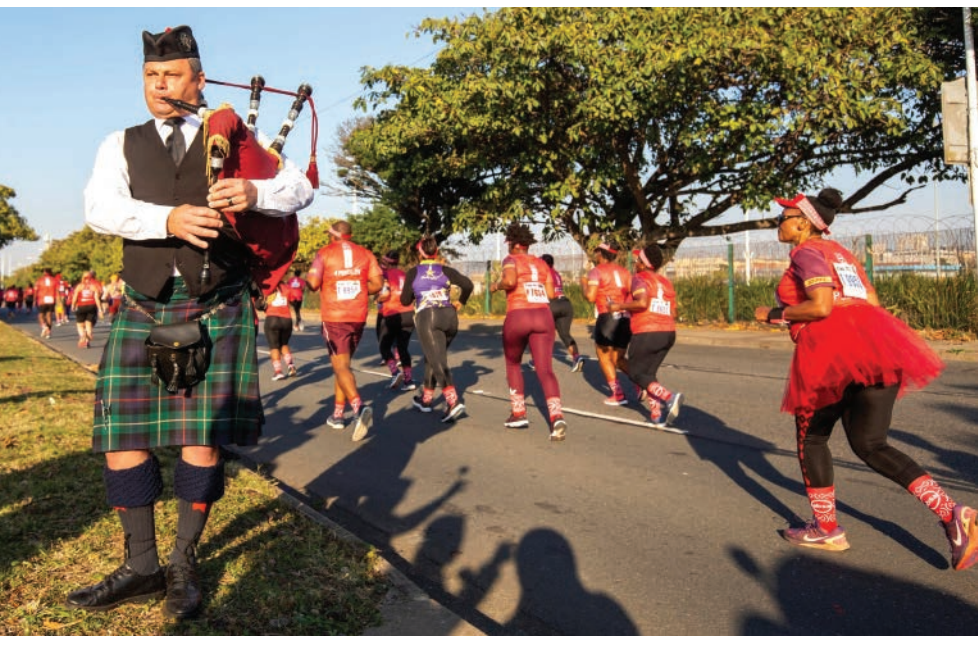
The Absa Run Your City Series treats runners to fantastic live on route entertainment.