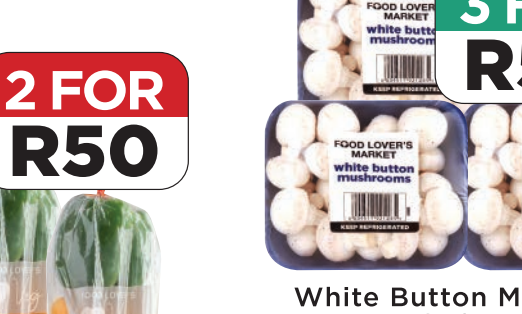
White Button Mushroom Punnets 250 g