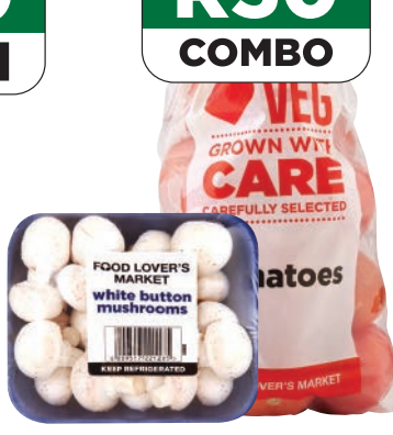
1 x Tomato Bag 2 kg 1 x White Button Mushroom Punnet 200 g