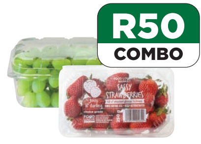
1 x Imported White Grape Punnet 1 x Strawberry Punnet 250 g