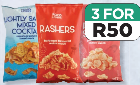
Food Lover's Mixed Cocktail, Prawn, Salt & Vinegar, Steak & Onion Rings or Lentils Snacks Chives & Pepper Feta 100 g/110 g/125 g