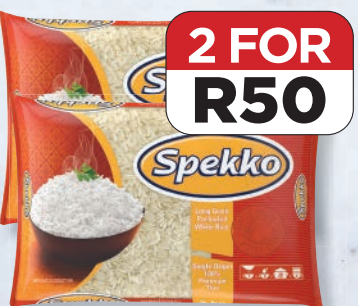
Spekko Parboiled Rice 2 kg