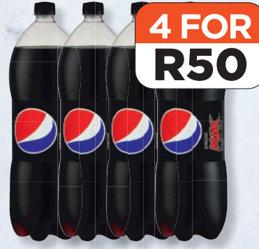
Pepsi Max 2 L