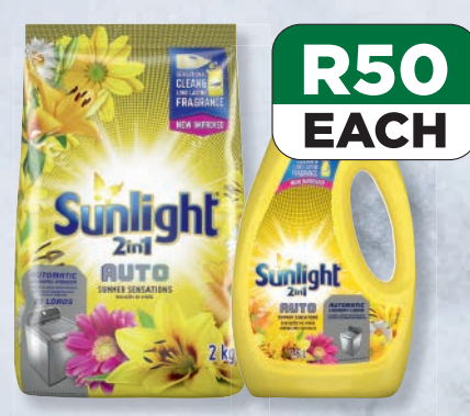
Sunlight Auto 2 kg or Liquid 1.5 L