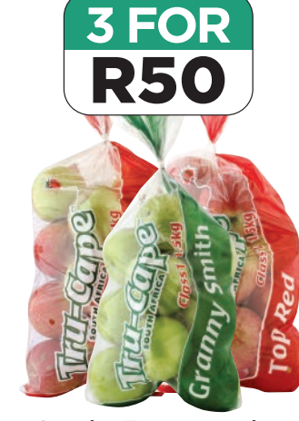
Apple Econopacks Assorted 1.5 kg