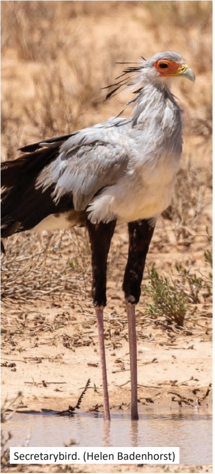
Secretarybird.