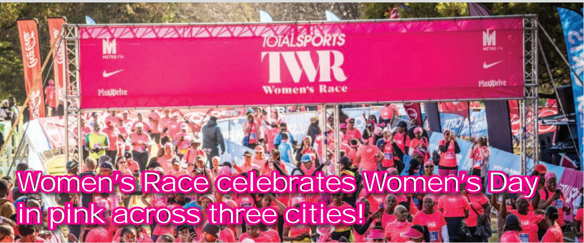
Women's Race celebrates Women's Day in pink across three cities!

For additional information on the Thirsti AfricanX Trailrun 3-Day, 2-Day and/or 1-Day events please visit www.stillwatersports.com , contact Stillwater Sports on 082 991 0045 or email entries@stillwatersports.com .