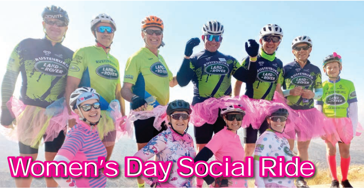
Women's Day Social Ride

BONUS - RUSTENBURG - Rustenburg Cycling Club (RCC) had a great turnout for the Women's Day Social Ride that took place on 9 August at Kgaswane. There were approximately 100 cyclists, all very enthusiastic (ladies, men, grandparents and juniors came and joined the fun ride). Thank you to Kgaswane, Land Rover, Avura, Voltex and Ola for the waterpoints with refreshments and food.