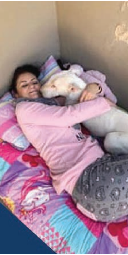
Why not show your love for animals with a Kennel Sleepover on 3 September in a special SPCA fundraising initiative? See article for more information.