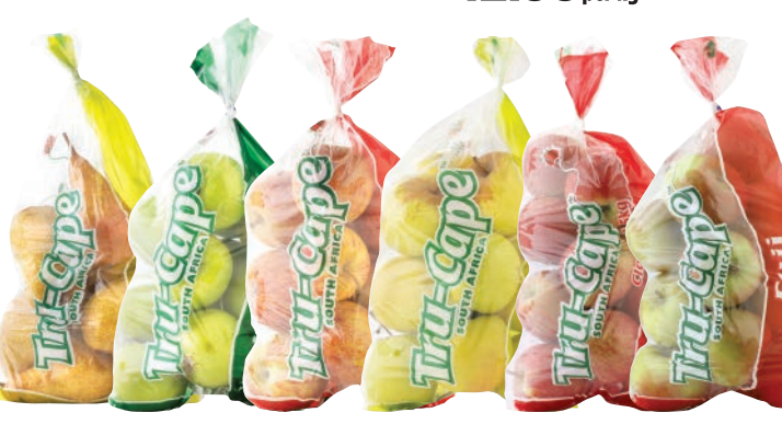
New Season Top Red, Royal Gala, Golden Delicious, Granny Smith or Fuji Apple & Pear Econopacks Assorted 1.5 kg 19.99each