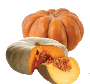
Crown or Muscat Pumpkins 19.99each