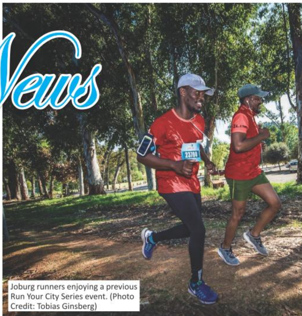
Joburg runners enjoying a previous Run Your City Series event.