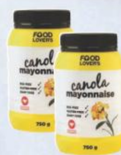
Food Lover's Canola Mayonnaise 750 g 2forR45