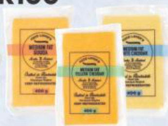
Food Lover's Cheddar, Gouda, Mozzarella or White Cheddar 400 g 3forR120