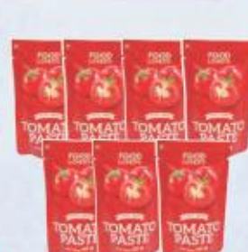
Food Lover's Tomato Paste 50 g 7forR25