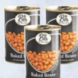
BIS Baked Beans 400 g 3forR25