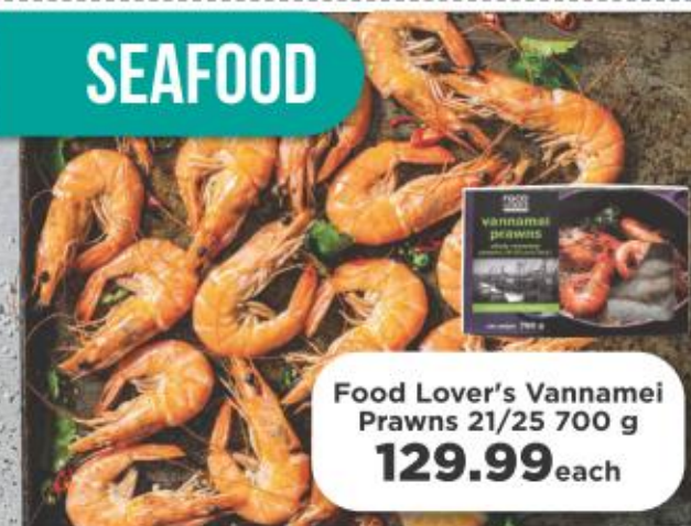
Food Lover's Vannamei Prawns 21/25 700 g 129.99 each