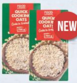
Food Lover's Quick Cooking Oats 750 g 2forR40