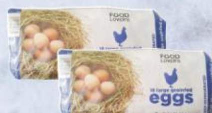
Food Lover's Large Eggs 18's 2forR55