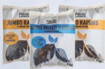
Food Lover's Raisins Jumbo Seedless or Food Lover's Raisins Jumbo Mix 1 kg any3forR100