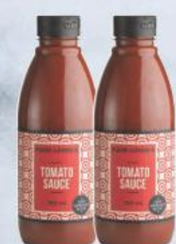
Food Lover's Squeeze Tomato Sauce 750 ml 2forR40