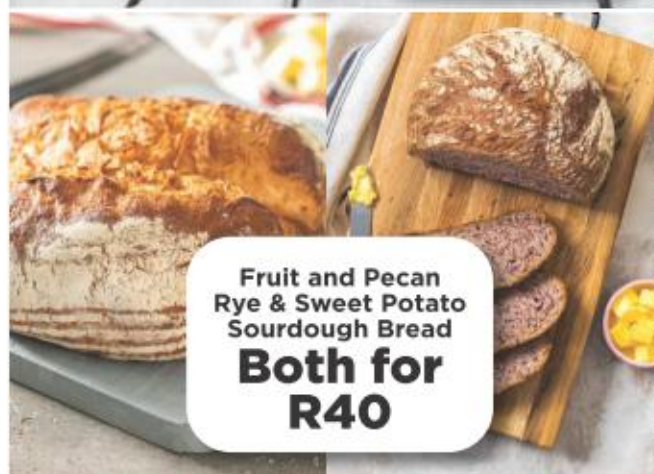
Fruit and Pecan Rye & Sweet Potato Sourdough Bread Both for R40