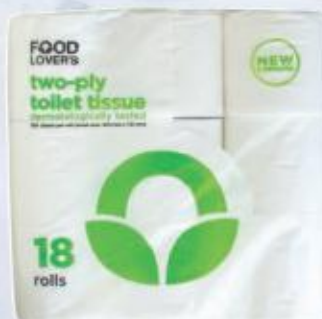
Food Lover's 2-ply Toilet Paper 18's 79.99 each