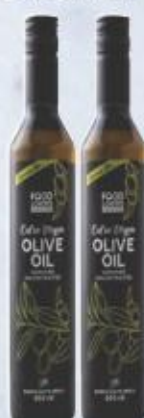
Food Lover's Squeeze Extra Virgin Olive Oil 500 ml 2forR100