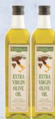
Santagata Extra Virgin Olive Oil 750 ml 79.99 each