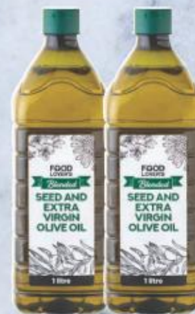
Food Lover's Blended Seed & Extra Virgin Olive Oil 1 L 2forR90