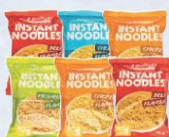
Food Lover's Noodles Assorted 75 g 6forR20