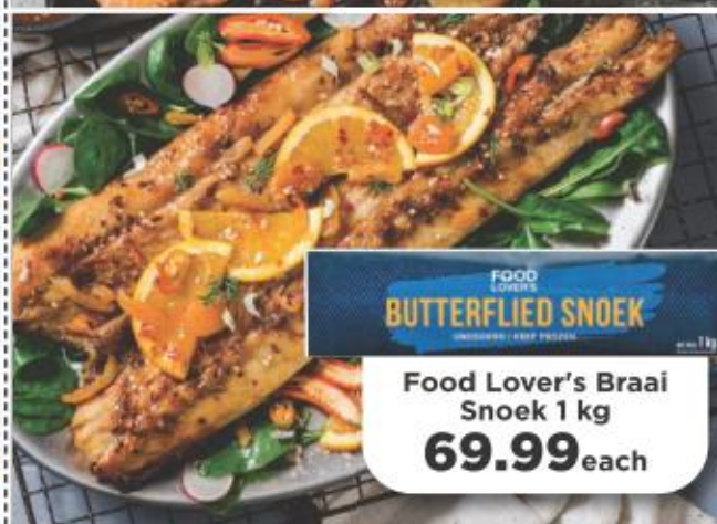
Food Lover's Braai Snoek 1 kg 69.99 each