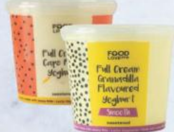
Food Lover's Full Cream Fruit or Smooth Yoghurt Assorted 1 kg 2forR50