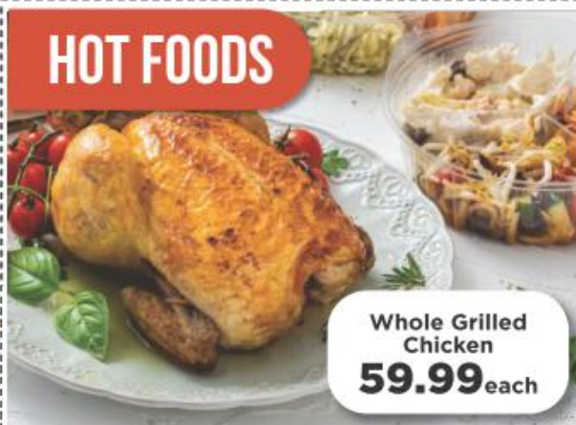
Whole Grilled Chicken 59.99 each