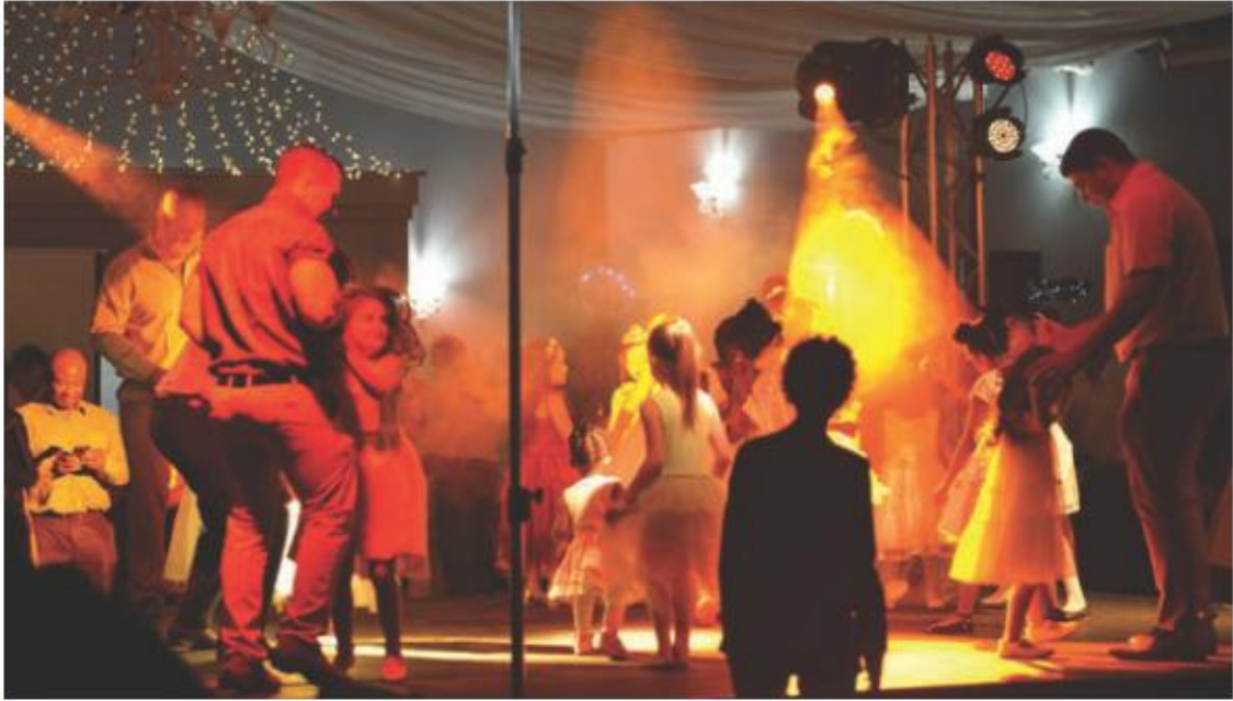
Everyone enjoyed Happy Feet Ballet's annual Father and Daughter Ball.