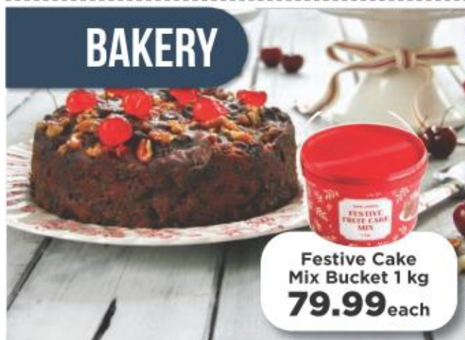
Festive Cake Mix Bucket 1 kg 79.99 each