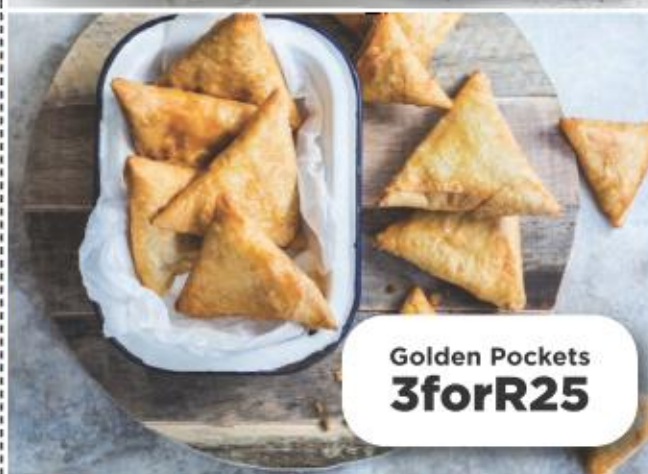
Golden Pockets 3forR25