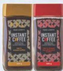
Food Lover's Instant Coffee or Decaf 200 g (Excluding Freeze Dried) 2forR100