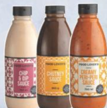
Food Lover's Squeeze Sauces or Marinades Assorted 750 ml 2forR70