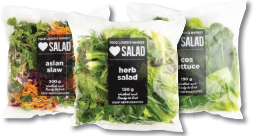
Asian Slaw, Cos Lettuce or Herb Salad 2forR50