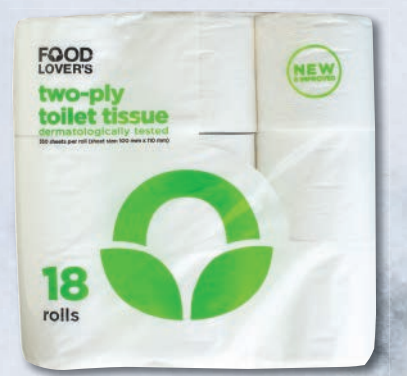
Food Lover's 2 Ply Toilet Paper 18's 79.99<sub>each</sub>