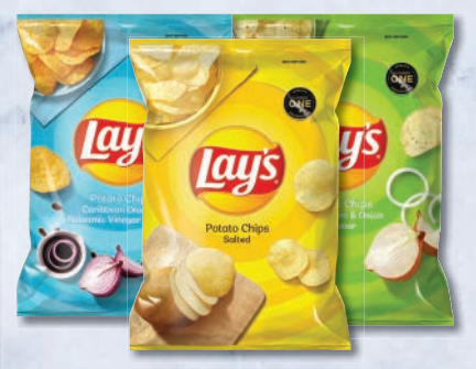
Lay's Chips Assorted 120 g 3forR48