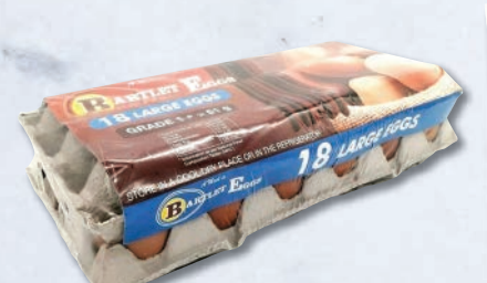
Bartlet Large Eggs 18's 29.99<sub>each</sub>