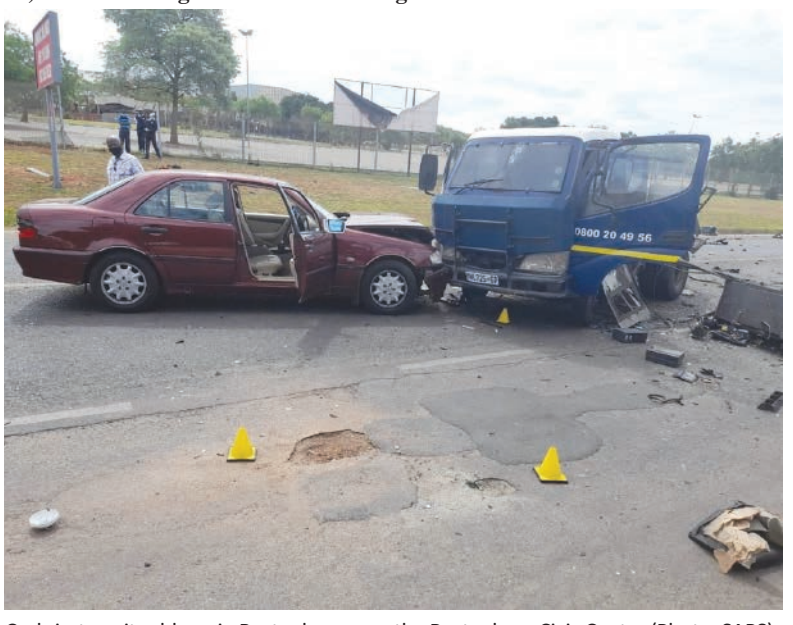
Cash-in-transit robbery in Rustenburg near the Rustenburg Civic Centre.

The police said they were studying the footage in more detail and would take action against those who were found breaking the law. Read more in this week's edition of the Rustenburg Herald for more information.