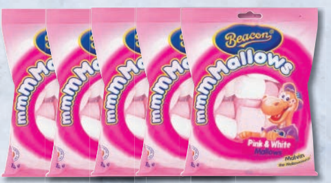
Beacon Pink & White Mallows 150 g 5forR55