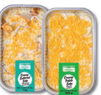
Potato Bake 900 g or Butternut Bake 1 kg

NEW Everyday Cheese Salad Tubs 39.99_{\mathsf{each}}