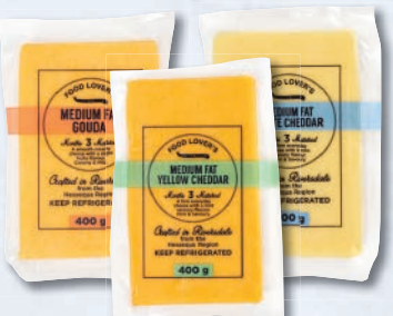
Food Lover's Cheddar, Gouda, Mozzarella or White Cheddar 400 g