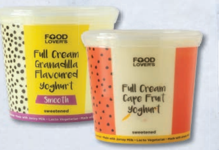
Food Lover's Full Cream Yoghurt Assorted 1 kg 2forR50