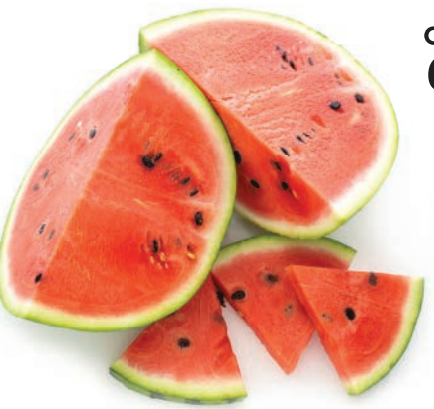
Watermelons 49.99 each