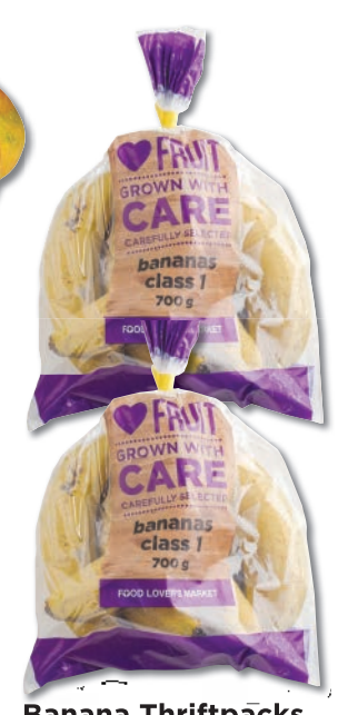
Banana Thriftpacks 2forR30