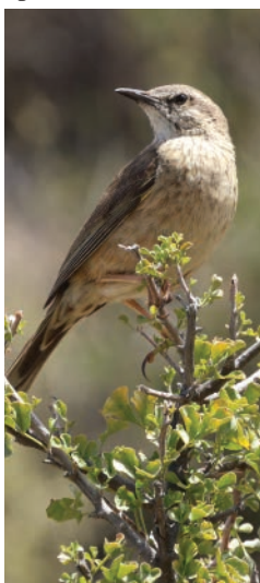
African Rock Pipit.