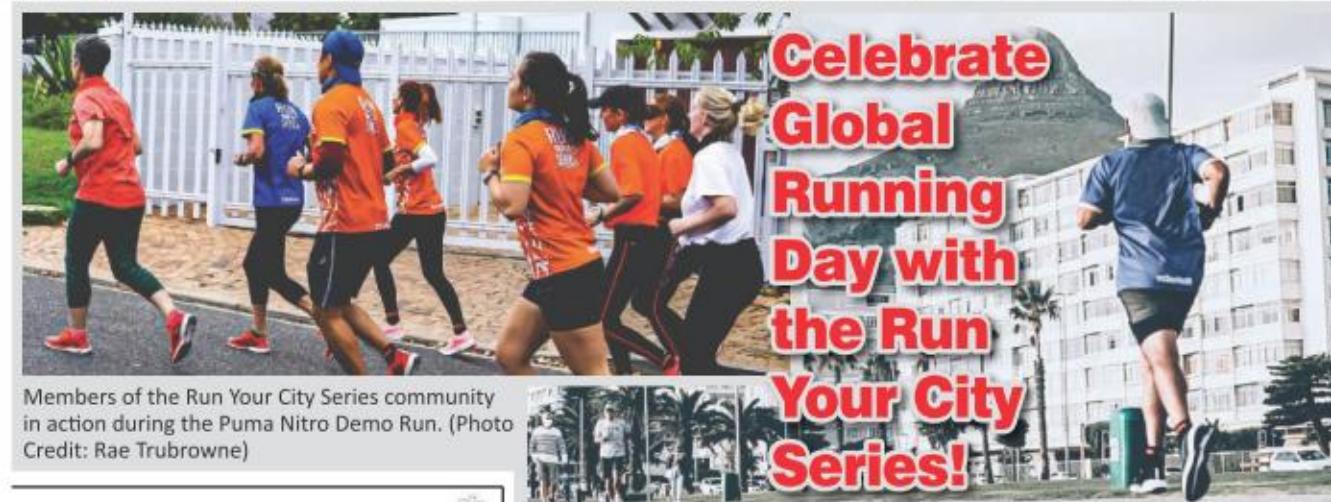
Members of the Run Your City Series community in action during the Puma Nitro Demo Run.

Despite it being a tough and challenging event, competitors enjoyed the Sugarbelt 400 with its unique race route.