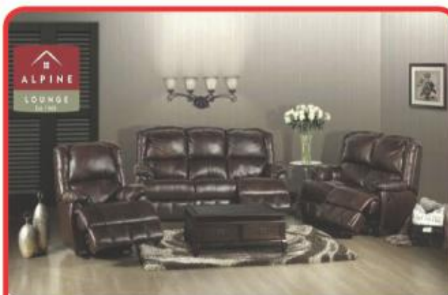
ALPINE 3 PIECE GENIUNE LEATHER 3 LAZYBOY SUITE