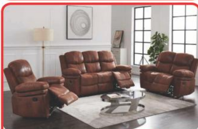
GENEVA 3 PIECE FABRIC 5 RECLINER LAZYBOY