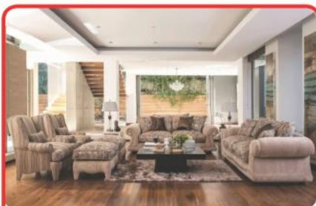
AVANTE 6 PIECE EXCLUSIVE LOUNGE SUITE