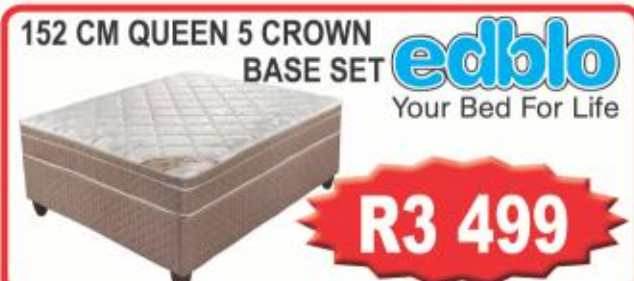
152 CM QUEEN 5 CROWN BASE SET