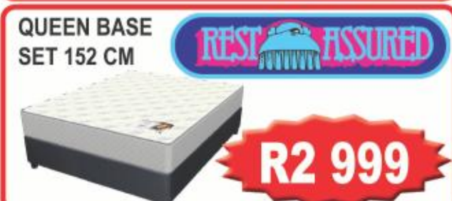
QUEEN BASE SET 152 CM