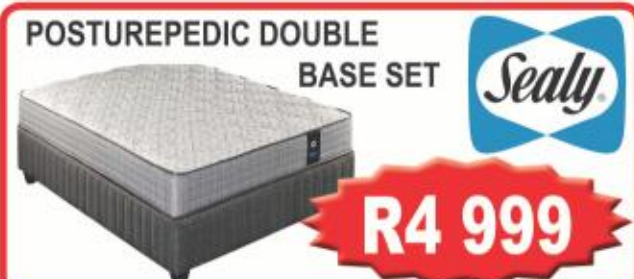
POSTUREPEDIC DOUBLE BASE SET