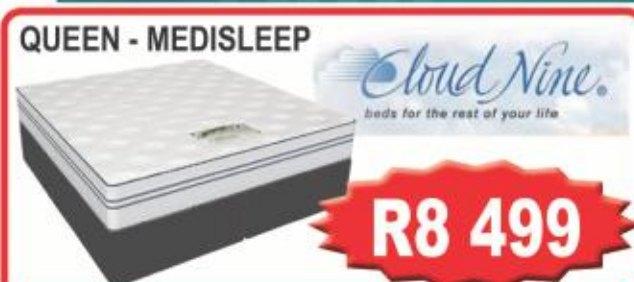
QUEEN - MEDISLEEP