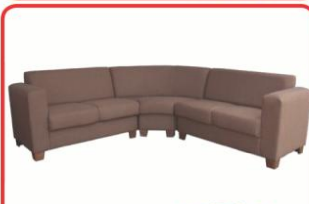
VERONICA 3 PIECE CORNER - FABRIC LOUNGE SUITE