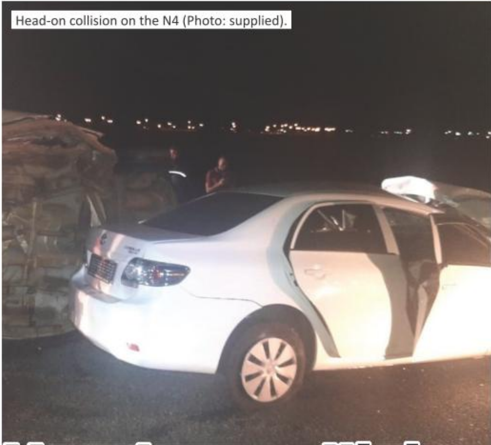
Head-on collision on the N4.