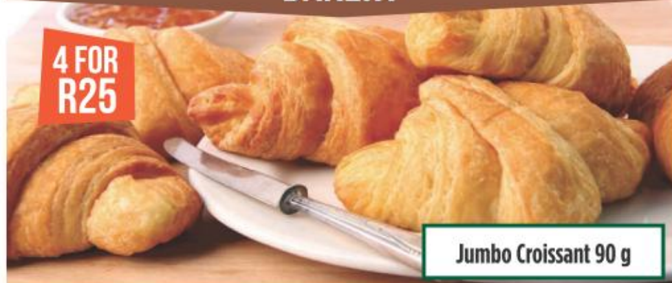
4 FOR R25