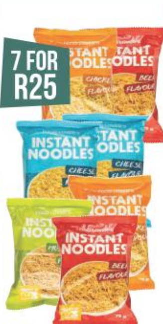
7 FOR R25 Food Lover's Noodles Assorted 75 g