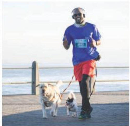
Members of the RYC Series Community enjoying being outdoors running.