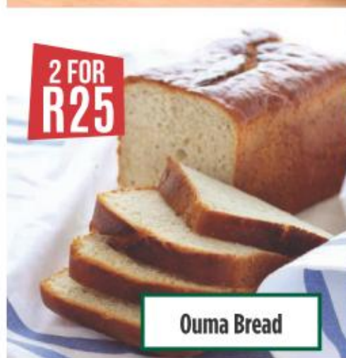
2 FOR R25