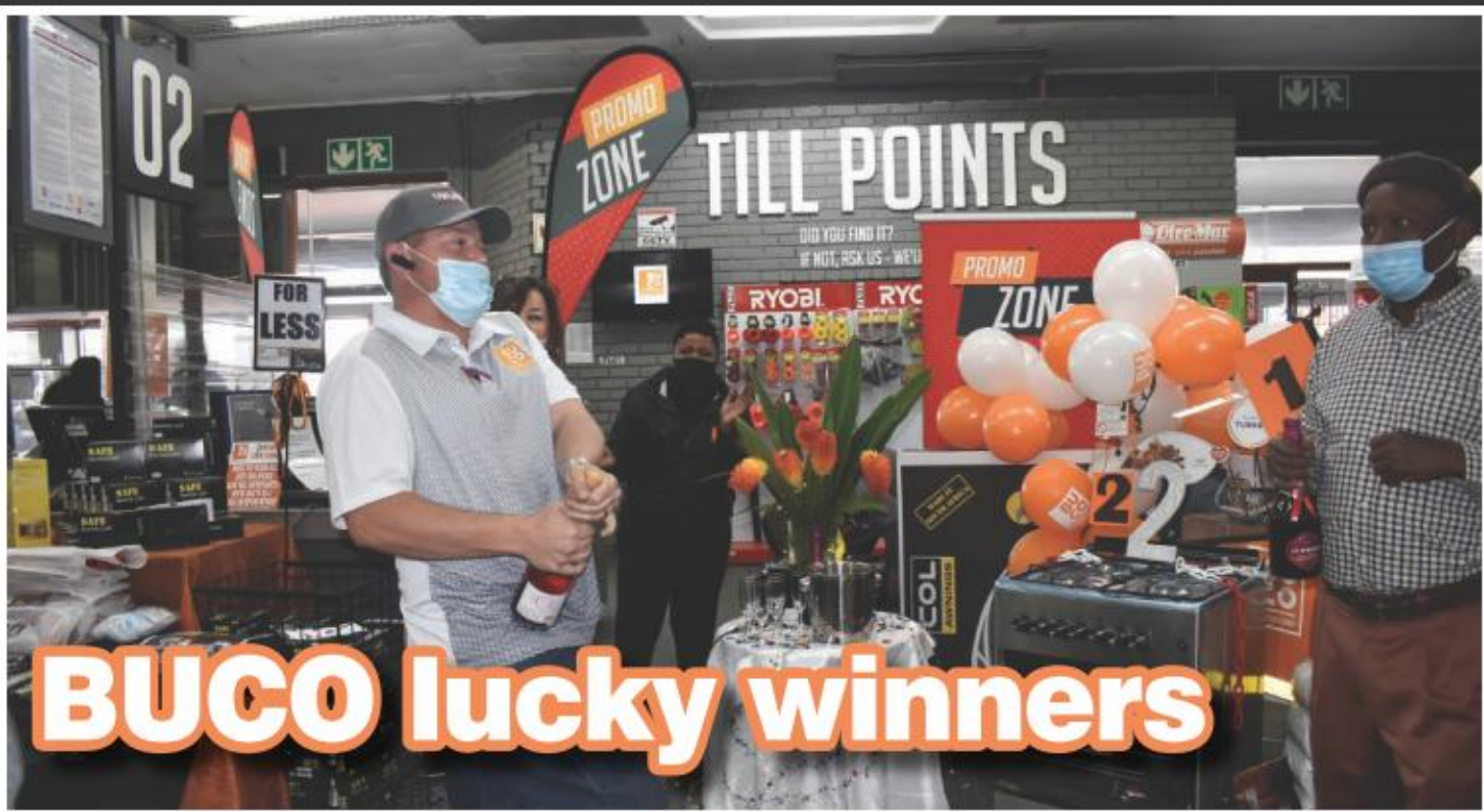
Three lucky customers of BUCO Rustenburg walked away with prizes in a competition that took place this weekend at BUCO. The winners had an opportunity to win a trailer full of building materials and a gas stove amongst others. See this week's edition of the Rustenburg Herald for more.

BONUS - RUSTENBURG - Residents are hereby advised that following the closure of the License and Testing Centre last week due to a positive case of Covid-19, services are now fully restored. Members of the community still urged to practice social distancing, sanitize and always have a mask on while accessing municipal services. The municipality apologized for the inconvenience this may have caused.