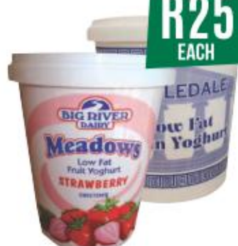
R25 EACH Ambledale Or Meadows Low Fat Yoghurt Assorted 1 kg