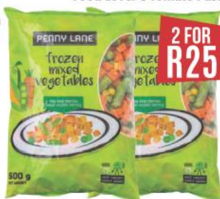
2 FOR R25 Penny Lane Diced Mixed Veg 500 g