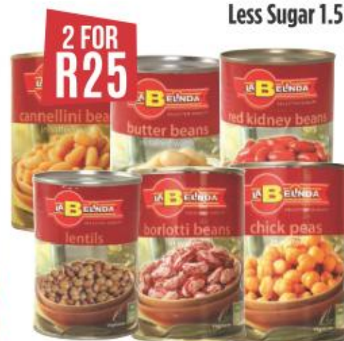
2 FOR R25 La Belinda Borlotti Beans, Butter Beans, Cannelloni Beans, Red Kidney Beans, Chickpeas or Lentils 400 g