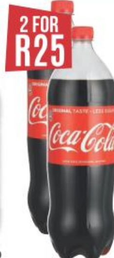
2 FOR R25 Coke Original Less Sugar 1.5 L