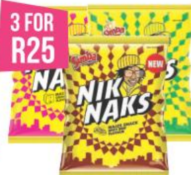
3 FOR R25 Simba Nik Naks Assorted 135 g