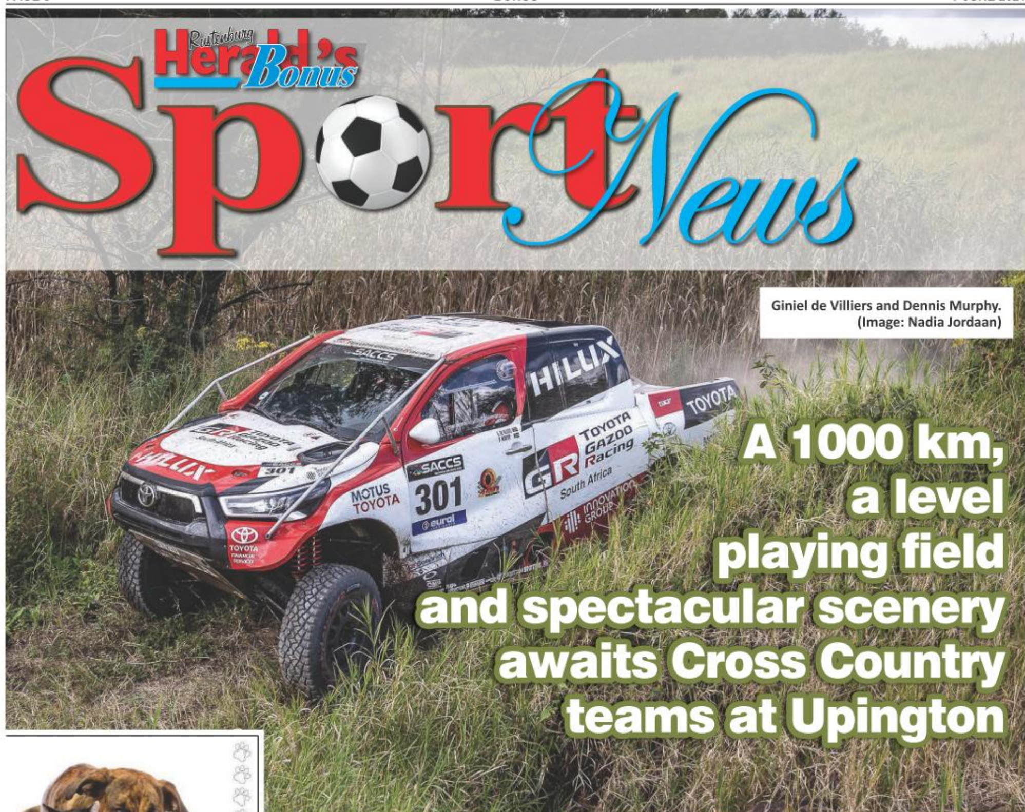
Giniel de Villiers and Dennis Murphy.

A 1000 km, a level playing field and spectacular scenery awaits Cross Country teams at Upington