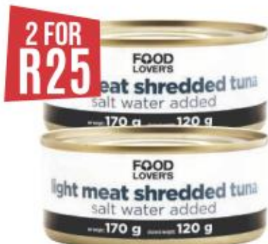
2 FOR R25 Food Lover's Shredded Tuna in Brine 170 g