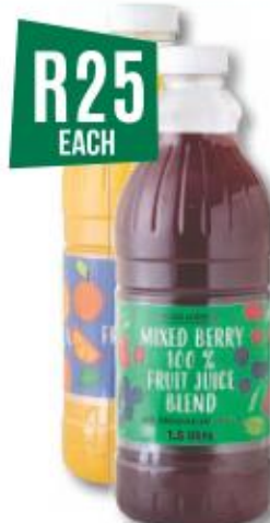
R25 EACH Food Lover's 100% Juice Assorted 1.5 L