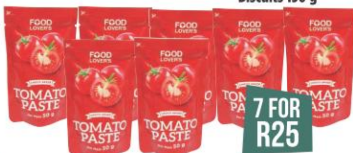
7 FOR R25 Food Lover's Tomato Paste 50 g