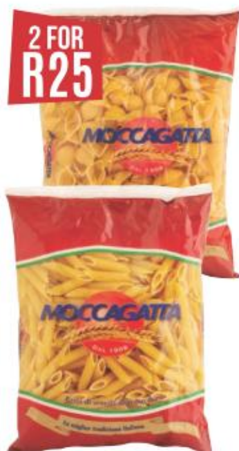
2 FOR R25 Moccagatta Pasta Assorted 500 g