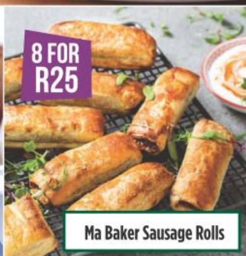
8 FOR R25