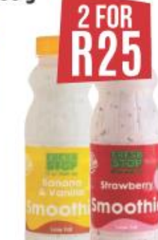
2 FOR R25 Fresh Stop Smoothie Assorted 350 ml