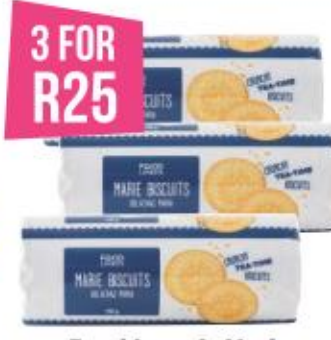
3 FOR R25 Food Lover's Marie Biscuits 150 g