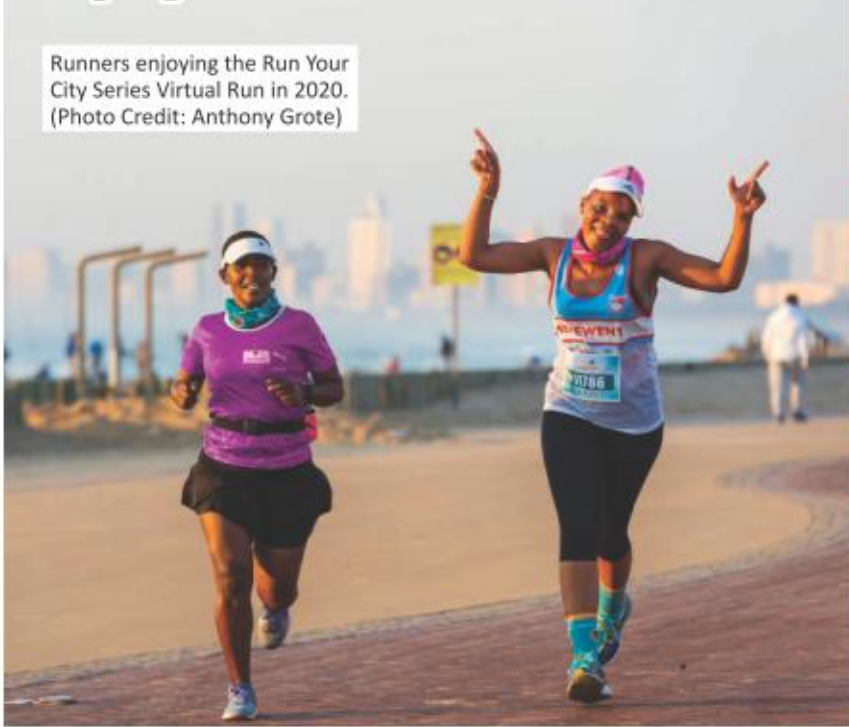
Runners enjoying the Run Your City Series Virtual Run in 2020.