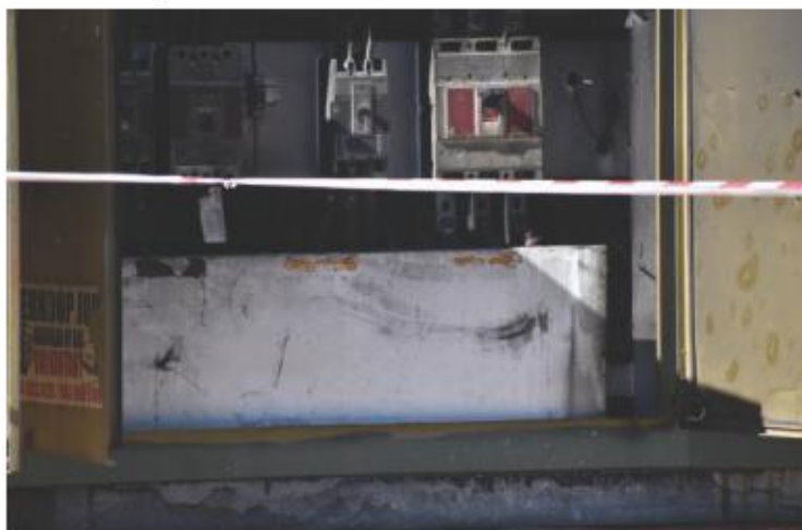
It is still not clear what the deceased was doing inside the sub-station in the first place.

According to information received, police and fire officials arrived at the scene to find the lifeless body of the man trapped inside the mini substation. It is believed that the man is homeless according to preliminary investigations. However it is not clear what he was doing inside the sub-station in the first place. The Rustenburg Local Municipality's electrical department had to be called in to switch off the power in the area so that the body of the deceased could be removed. The police have registered a case of inquest.