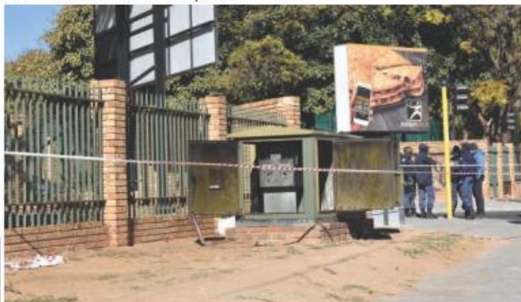
The power in the area had to be switched off to allow officials to remove the deceased.