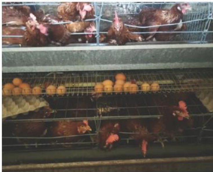
In these cages, the Rustenburg SPCA discovered dead chickens in various stages of decomposition.