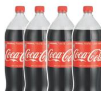
Coke Original Less Sugar 1.5 L 4forR50