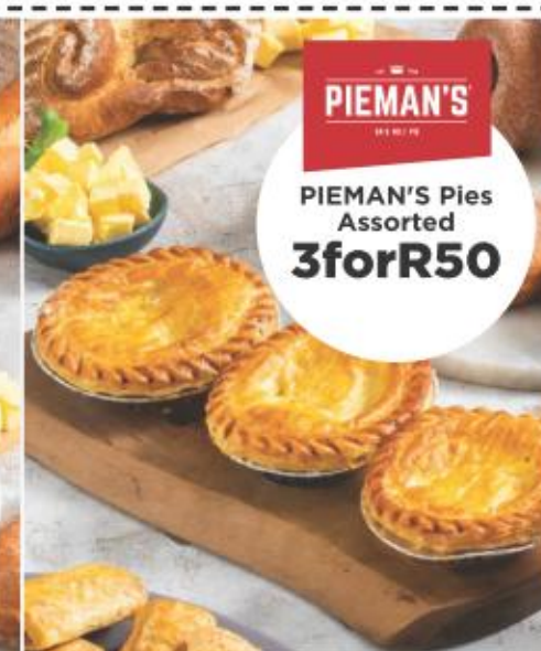
PIEMAN'S Pies Assorted 3forR50