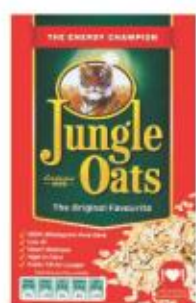
Jungle Oats Original 1 kg 25.99 each