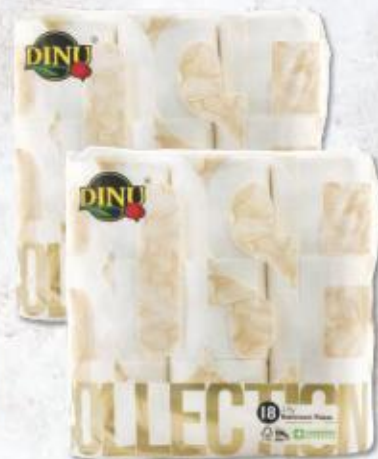
Dinu Rose White 2-ply Toilet Paper 18's 2forR170