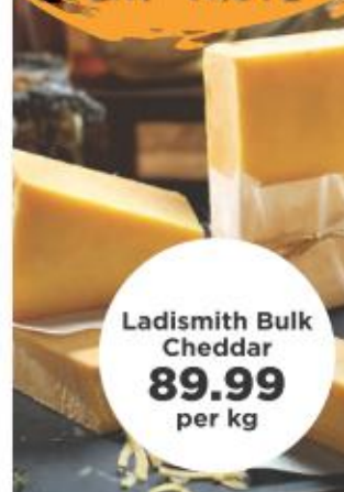
Ladismith Bulk Cheddar 89.99 per kg