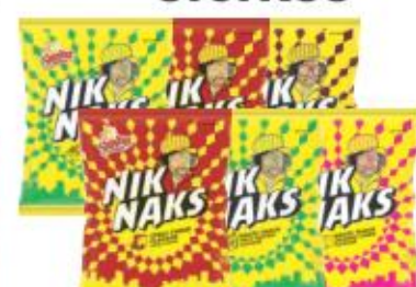
Simba Nik Naks Assorted 135 g 6forR50