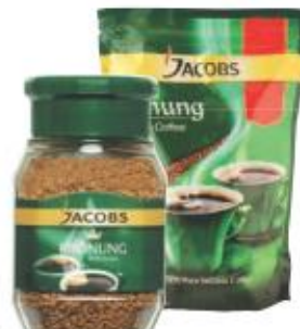
Jacobs Krönung 200 g or Pouch 230 g 84.99 each