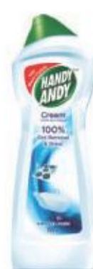
Handy Andy Assorted 750 ml 19.99 each