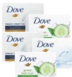
Dove Soap Assorted 100 g 5forR50