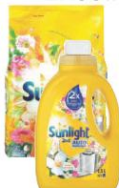
Sunlight Auto 2 kg or Liquid 1.5 L 2forR80