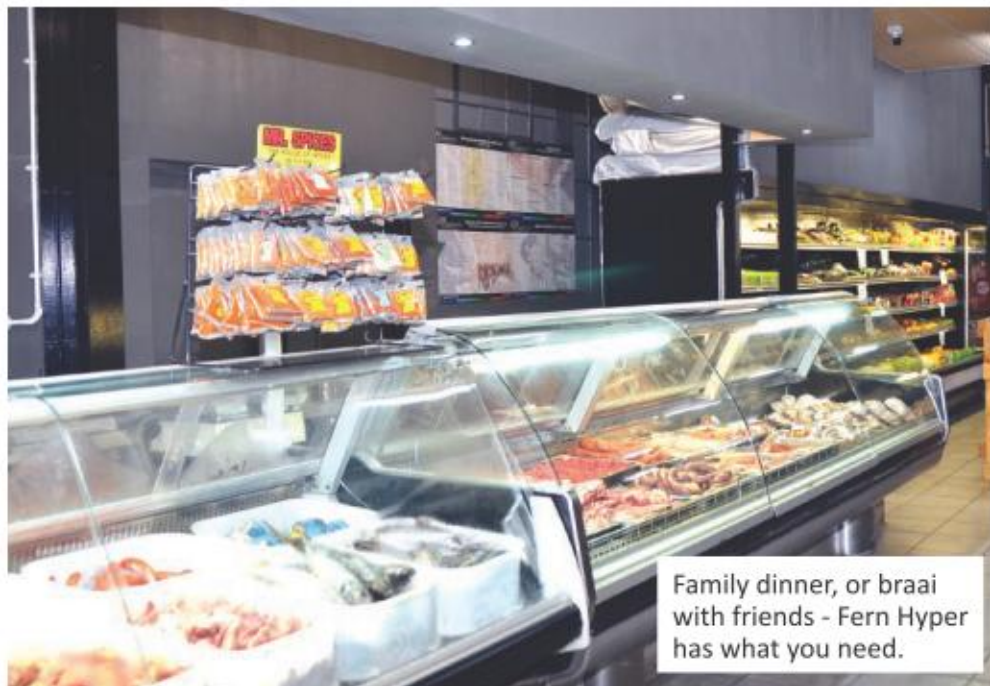
Family dinner, or braai with friends - Fern Hyper has what you need.