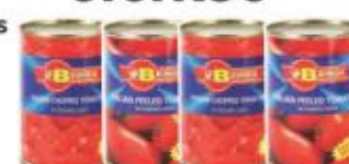
La Belinda Chopped or Peeled Tomatoes 400 g 4forR50