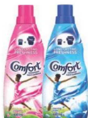
Comfort Fabric Conditioner Assorted 800 ml 2forR75