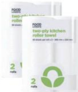
Food Lover's Kitchen Towels 2's 2forR30