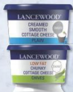
Lancewood Cottage Cheese Assorted 250 g 26.99 each