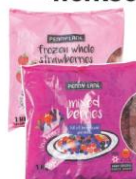
Penny Lane Frozen Strawberries 1 kg & Mixed Berries 1 kg BothforR100