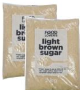
Food Lover's Light Brown Sugar 2 kg 2forR60