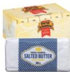
First Choice Butter or Food Lover's Butter 500 g 2forR100