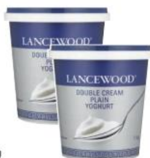
Lancewood Double Cream Yoghurt Assorted 1 kg 27.99 each