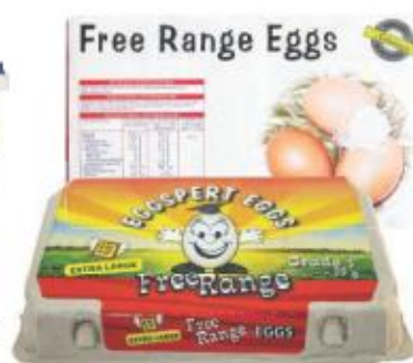
Alzu or Eggsperter Free-Range Extra Large Eggs 15's 2forR50