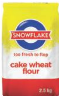
Snowflake Cake Flour 2.5 kg 23.99 each