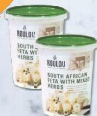
Roulou Feta Assorted 400 g 2forR75