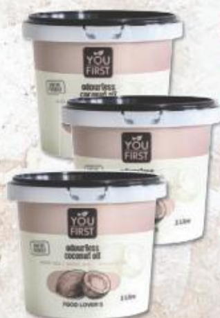
You First Odourless Coconut Oil 1 L 3forR100