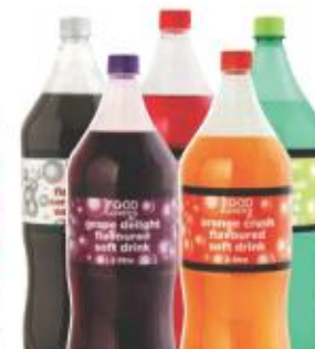
Food Lover's Carbonated Soft Drinks Assorted 2 L 5forR55