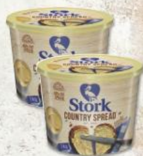
Stork Spread Tub 1 kg 2forR70