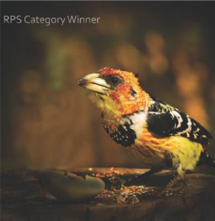
RPS Category Winner