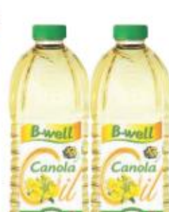
B-Well Canola Oil 2 L 2forR110