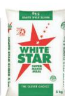
White Star Super Maize Meal 5 kg 42.99 each