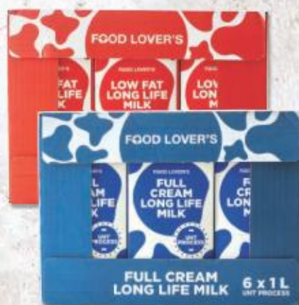
Food Lover's UHT Long Life Low Fat or Full Cream Milk 6 x 1 L 72.99 each