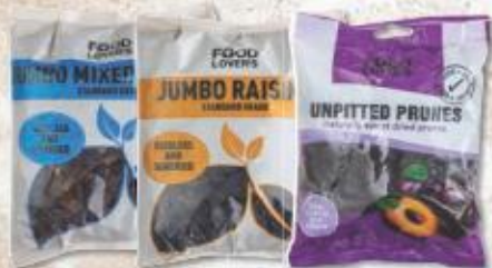
Food Lover's Raisins Jumbo Seedless 1 kg, Raisins Jumbo Mix 1 kg or Prunes 500 g Any3forR100