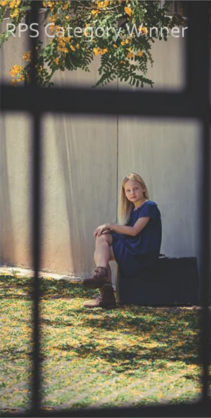
RPS Category Winner