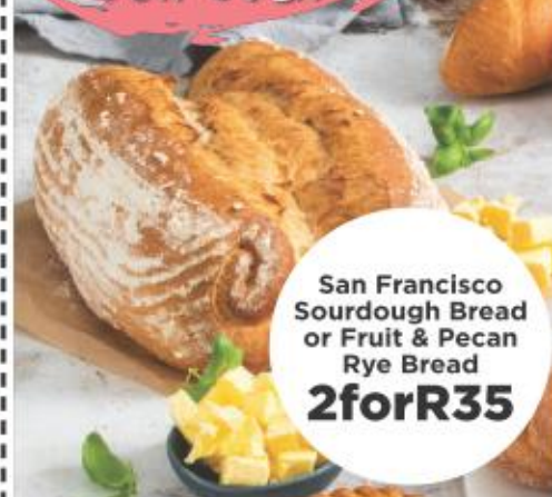
San Francisco Sourdough Bread or Fruit & Pecan Rye Bread 2forR35