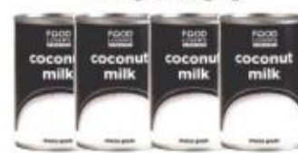
Food Lover's Coconut Milk 400 ml 4forR50