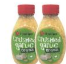
I Love Spice Crushed Garlic Squeeze 375 ml 2forR45