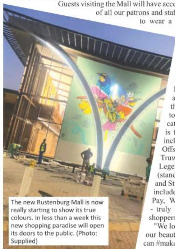
The new Rustenburg Mall is now really starting to show its true colours. In less than a week this new shopping paradise will open its doors to the public. (Photo: Supplied)

Ready for action! These corridors may still be empty, but from 29 April they will be bustling with customers exploring the new Rustenburg Mall. (Photo: Supplied)