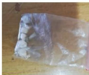
Five rock drugs, with an estimated street value of R250.