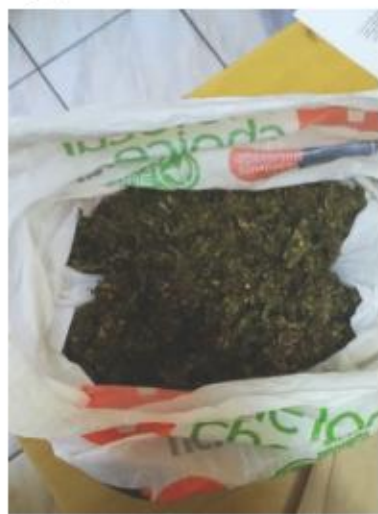
Recovered dagga to the value of R1500.

Information received from Captain Elsabe Augoustides suggests that the police received a tip-off concerning possible drugs kept in a house in the township. The suspect's house was searched and dagga with a street value of R1500 was found. This suspect was arrested for dealing in dagga. Additional information led to yet another arrest of a 29-year-old suspect who was found in possession of five rock drugs, with an estimated street value of R250. The suspects have already appeared before the Rustenburg Magistrates Court.