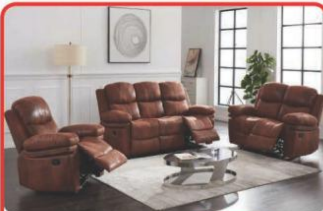
GENEVA 3 PIECE FABRIC 5 RECLINER LAZYBOY