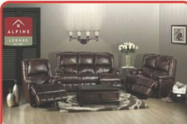
ALPINE 3 PIECE GENUINE LEATHER 3 LAZYBOY SUITE