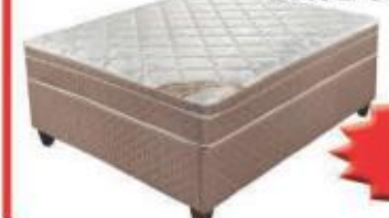
152 CM QUEEN 5 CROWN BASE SET