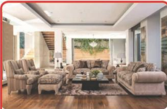
AVANTE 6 PIECE EXCLUSIVE LOUNGE SUITE