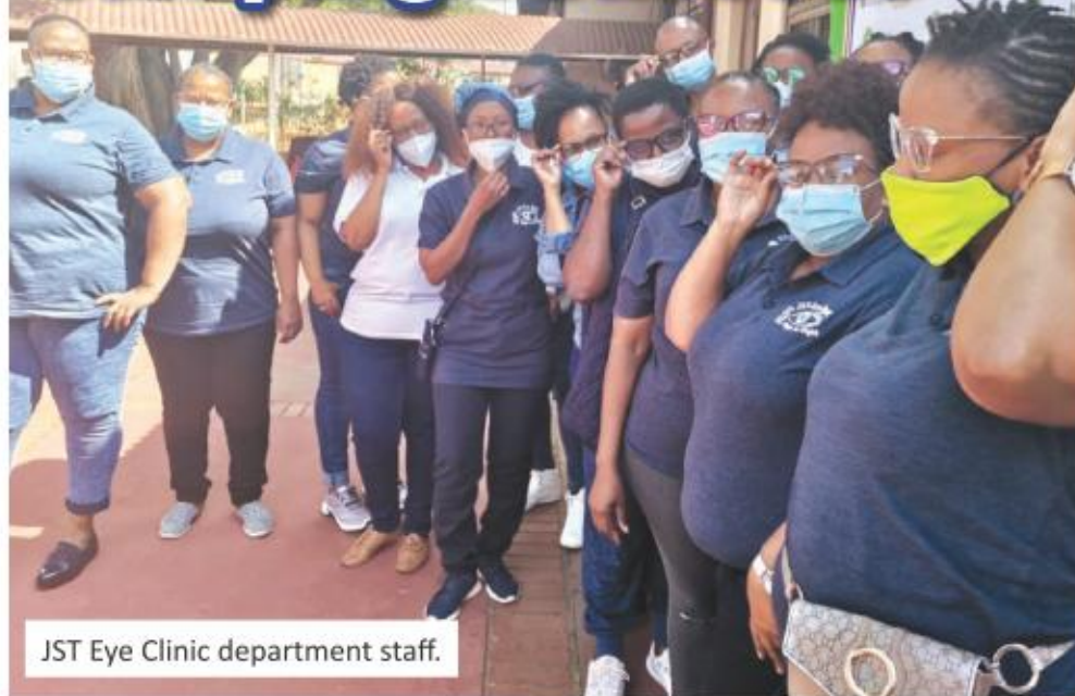
JST Eye Clinic department staff.

BONUS - RUSTENBURG - Job Shimanakana Tabane Hospital ran a campaign on Saturday (17 April) and Sunday (18 April) for members of the public to collect their spectacles.