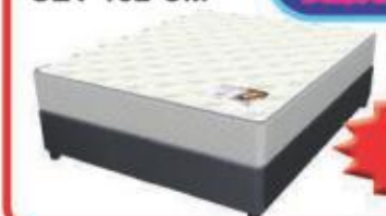
QUEEN BASE SET 152 CM