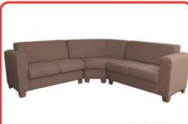
VERONICA 3 PIECE CORNER - FABRIC LOUNGE SUITE