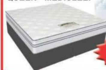
QUEEN - MEDISLEEP

Cloud Nine Beds for the rest of your life