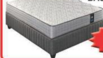
POSTUREPEDIC DOUBLE BASE SET