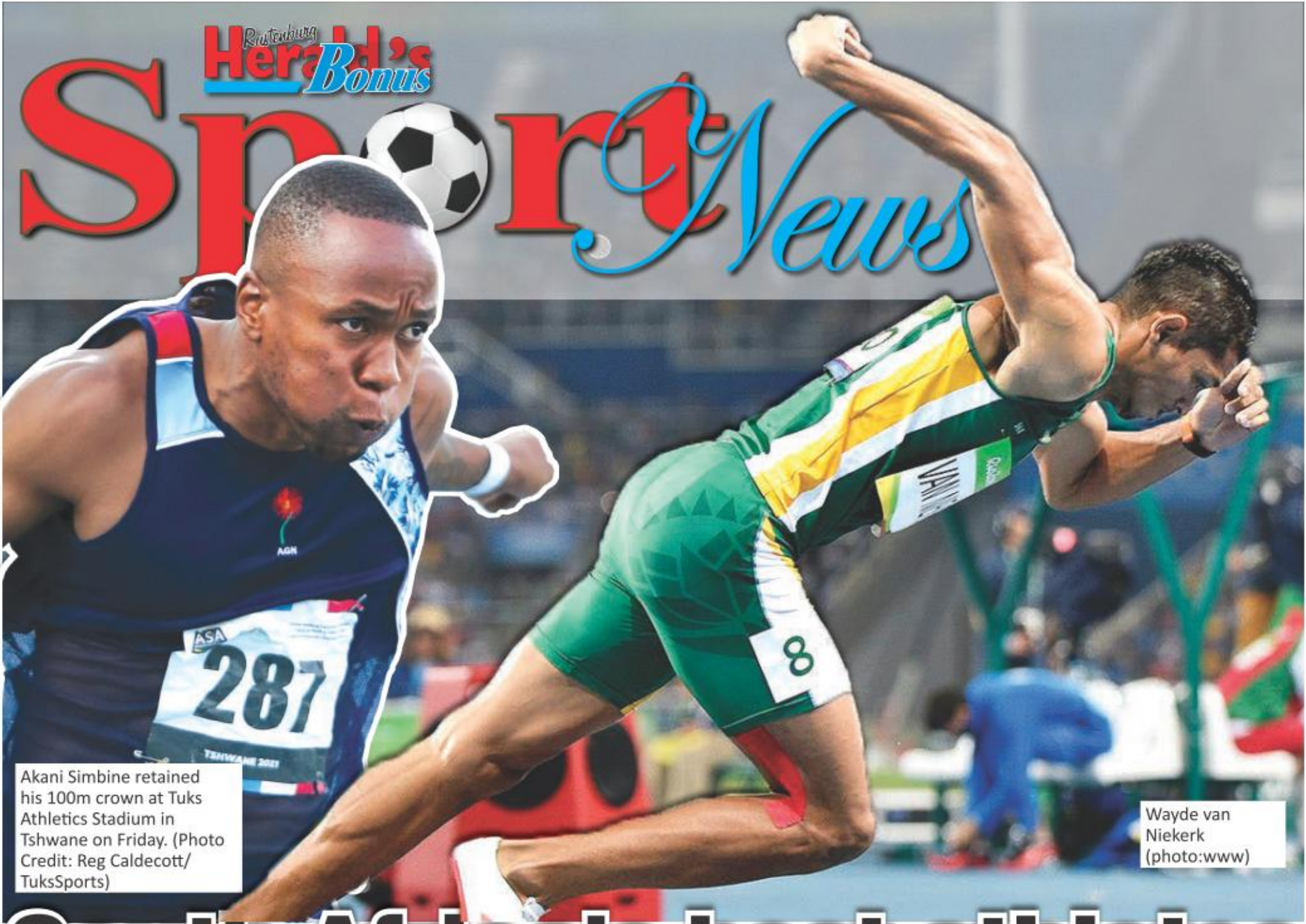
Akani Simbine retained his 100m crown at Tuks Athletics Stadium in Tshwane on Friday.