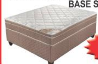
152 CM QUEEN 5 CROWN BASE SET