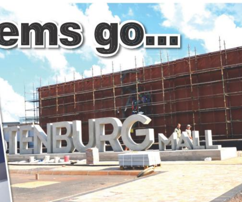
The new Rustenburg Mall is nearing completion rapidly. Bonus/Rustenburg Herald visited the premises recently. Here is a little look at how teams were hard at work to get everything shipshape in time for the grand opening at the end of April 2021.