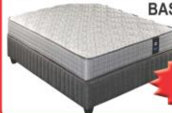
POSTUREPEDIC DOUBLE BASE SET