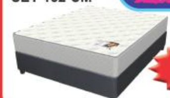
QUEEN BASE SET 152 CM