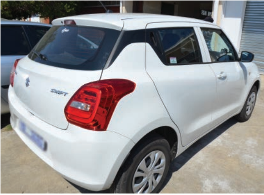
Police suspect that this rental vehicle was used by hijackers in incidences in the city.

Read more in this week’s Rustenburg Herald.