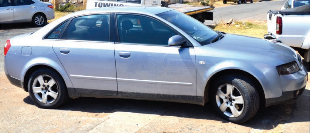
One of the recovered vehicles found at a house in Protea Park on Monday morning.

BONUS - RUSTENBURG - Police here have pounced on a residence in Protea Park in the early hours of Monday morning (7 September).