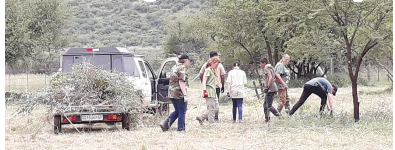
Makanyane volunteers at work in the park.

BONUS - RUSTENBURG - "After many years of activity in Rustenburg the Wildlife Society is sadly closing down.