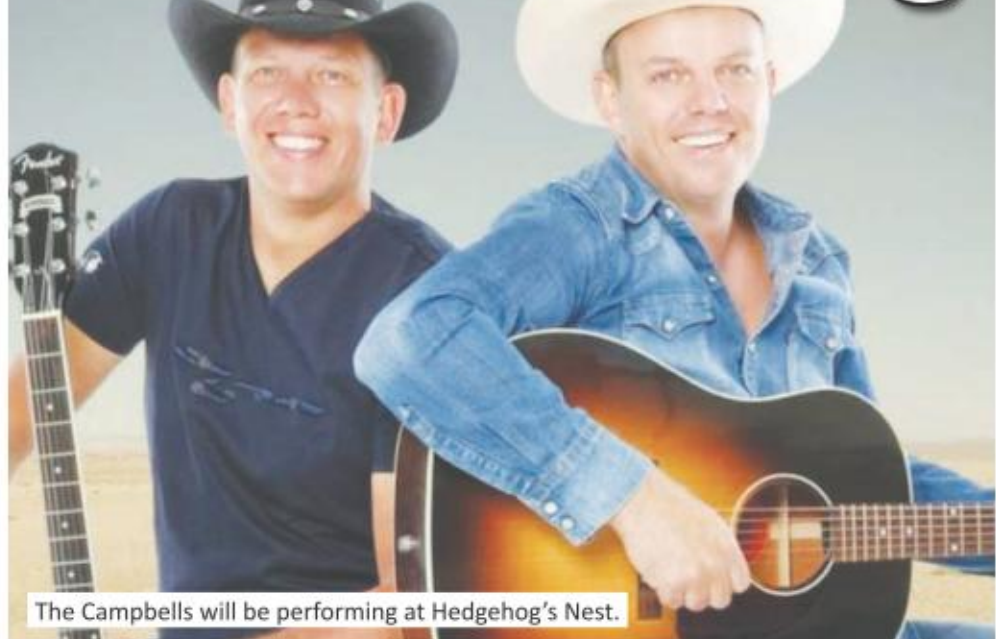
The Campbells will be performing at Hedgehog's Nest.

BONUS - RUSTENBURG - Lighthouse Children's Home: It is time to do a fundraiser with the Campbells. Due to high demand in ticket sales a second show will be taking place on 13 November 2020. Come and enjoy a wonderful evening at Hedgehog's Nest and support the Lighthouse Children's Home. Doors open at 18:00 and the show will be starting at 19:30. For more information and tickets please contact 083 493 5911/082 780 1052.