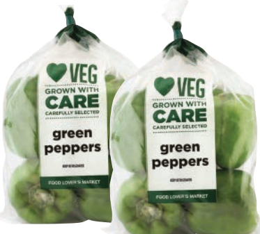
Green Pepper Thriftpacks 2forR25