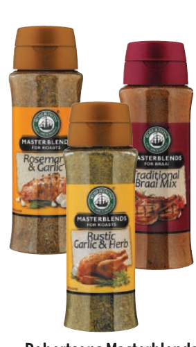
Robertsons Masterblends Spices Assorted 200 g 21.99 each