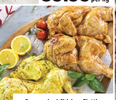
Pre-cooked Chicken Flatties (BBQ, Peri-Peri or Lemon & Herb) R40each