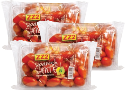
Spanish Santé Cocktail Tomato Prepacks 3forR25