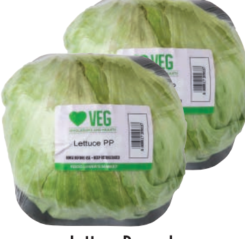
Lettuce Prepacks 2forR25