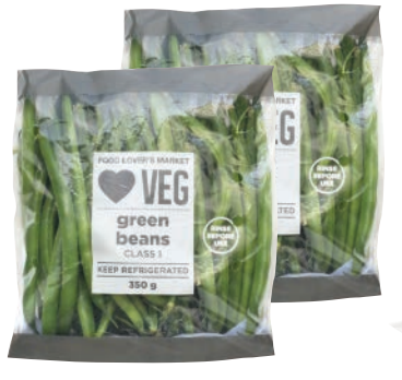
Green Bean Thriftpacks 350 g 2forR25