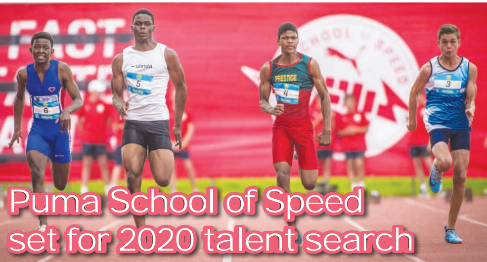
The much-anticipated Puma School of Speed Series will host five action packed meets between 22 January 2020 and 29 February 2020. Headed by the World's Fastest Man, Usain Bolt, the Puma School of Speed Series was launched in 2016 with the goal of identifying exceptional young South African athletes who believe that their future is #ForeverFaster.