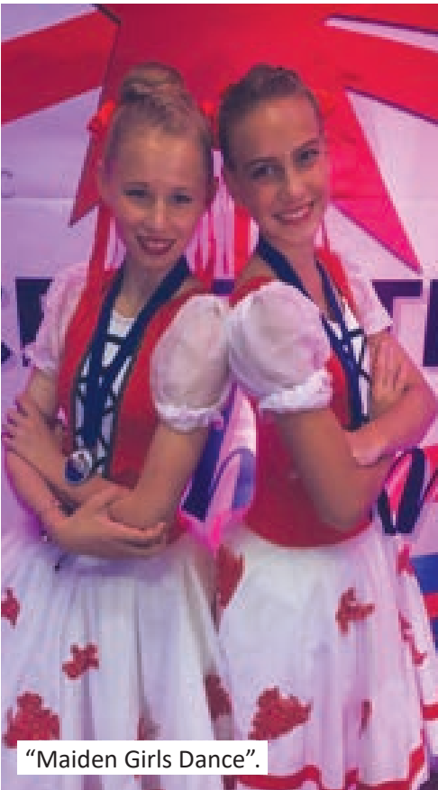
“Maiden Girls Dance”.

At Happy Feet Ballet they strive for excellence and quality in their dancers. They are exceptionally proud to announce that their hardworking students, who took part, took home the following silver medals: Harvest Dance (83%), Juicy Wiggle (83.5%), Feeling Good (84%), Polish Court (83.5%), Prayer Dance (83%), Maiden Girls (84%), Flower Girls (83.5%). Congratulations on your accomplishments and for flying Happy Feet Ballet’s name high!