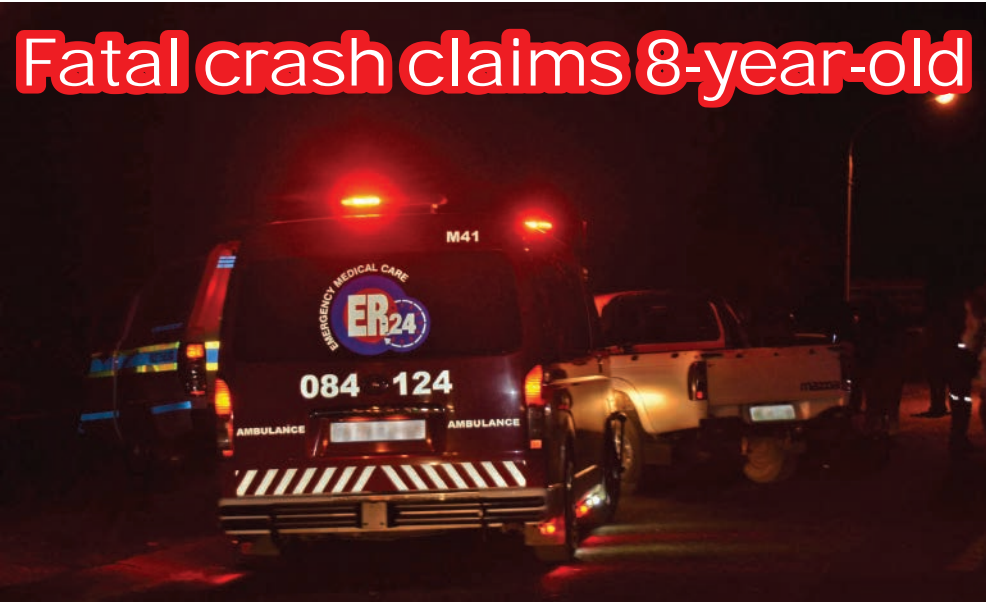
Emergency services on the scene of the fatal crash in Helen Joseph Drive that claimed the life of an eight year-old girl.

The accident happened just after 18:00 in Helen Joseph Drive, just after the Arend Drive turn-off. According to the police, the 29-year-old driver of the white Toyota bakkie claims that he felt the vehicle shudder just as he was crossing the bridge. He says after the shudder, he lost control of the vehicle. The bakkie rolled, slinging three passengers, a 39-year-old woman and her two children – eight –and three-years-old respectively – from the vehicle. The woman and three-year-old little boy sustained serious injuries, while the eight-year-old girl succumbed to her injuries. According to eyewitness reports on social media, the bakkie travelled at high speed when the accident happened, allegedly ignoring the red traffic light at the crossing of Helen Joseph Drive and Arend Road. The drivers of other vehicles said they had to swerve desperately to avoid being hit by the bakkie before it rolled.