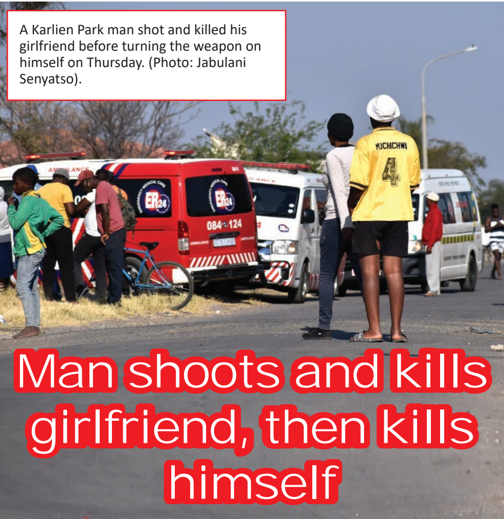
A Karlien Park man shot and killed his girlfriend before turning the weapon on himself on Thursday.