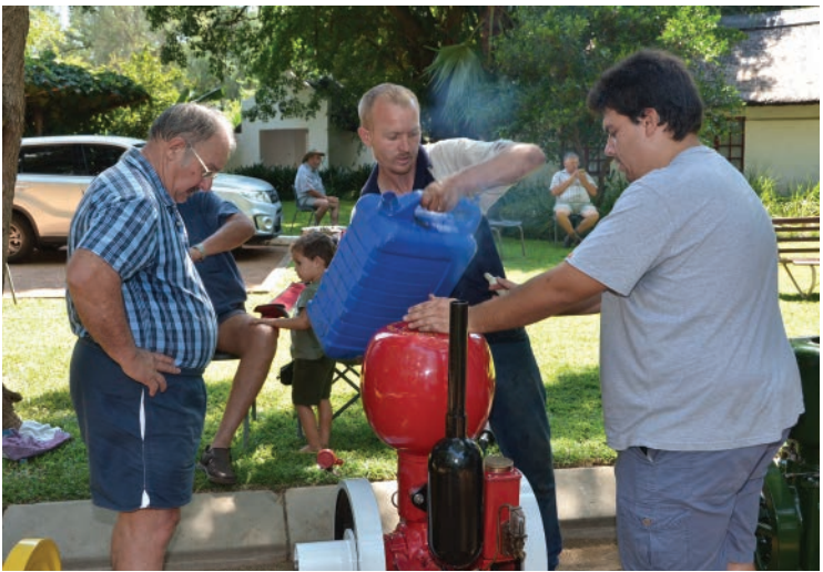
"Ok guys, let me have a go with the gas - don't let up on the gas pedal please..." Three gentlemen from Rustenburg's club for antique static engines getting all excited at the club's annual show and open day at Paul Kruger Lodge just outside Rustenburg on Saturday.