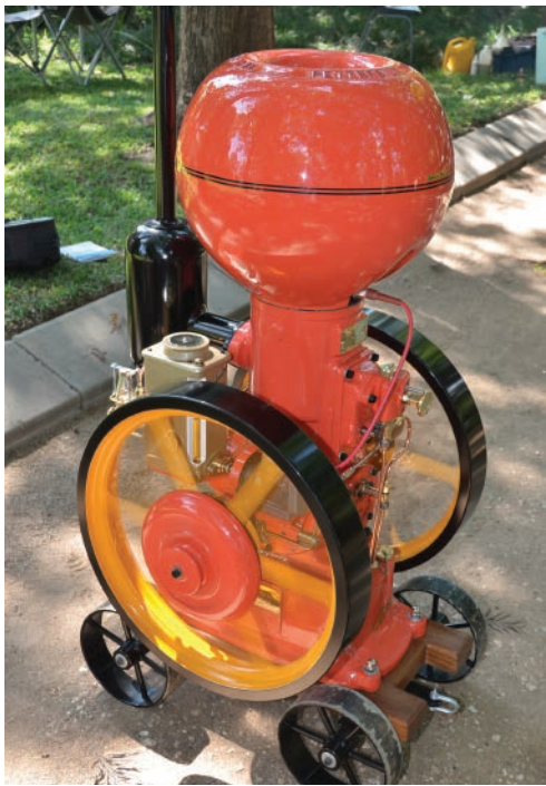
A restoration project nothing short than a work of art - a static engine painstakingly resored by Mike Loots of the Rustenburg static engine fraternity displayed at Saturday's annual show and open day at Paul Kruger Lodge just outside Rustenburg. This wonderful model is full working condition is a 1933 Petter 5hp engine.