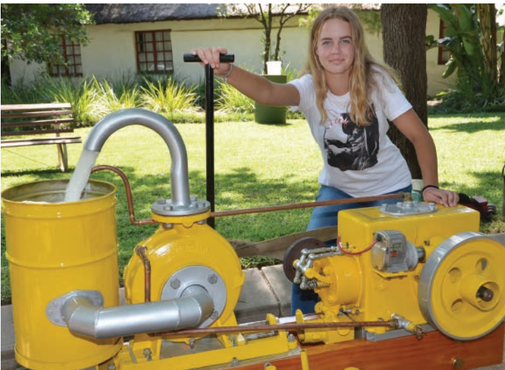
A pretty picture for anyone remembering the pioneering days in South Africa. A "FF" (Farmers Friend) water pump and "generator" from the late nineteen thirty's and thank goodness, a pretty girl who is much younger!