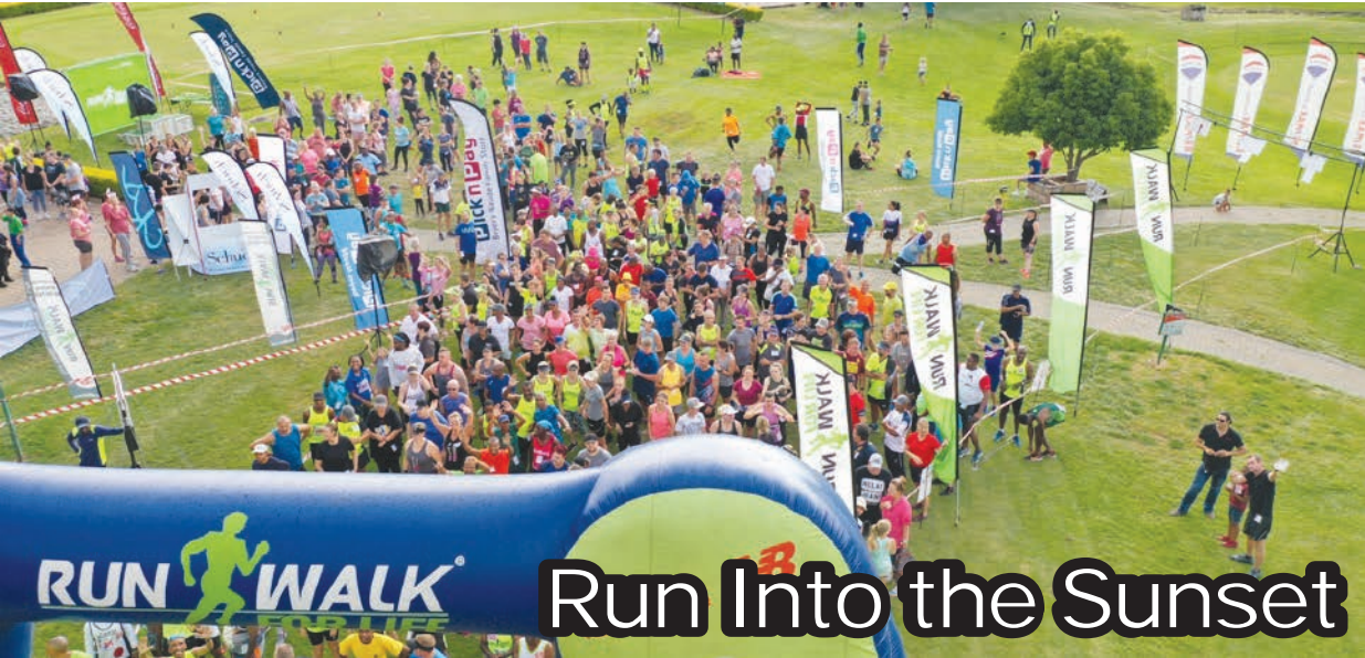
The Run into the Sunset event at the Rustenburg Golf Club was a huge success. Thanks for all the support from the community. The next run will be on Thursday 1 October 2020.