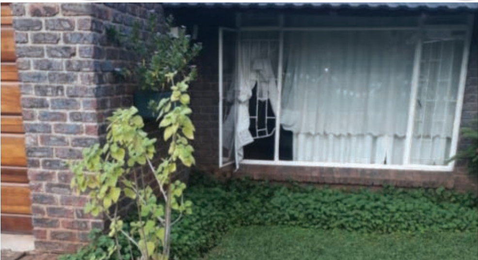
The window where an armed intruder gained access to a home in Wilgeriver Avenue, Cashan.