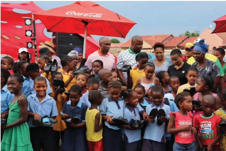
Ward 9 learners receive shoes.