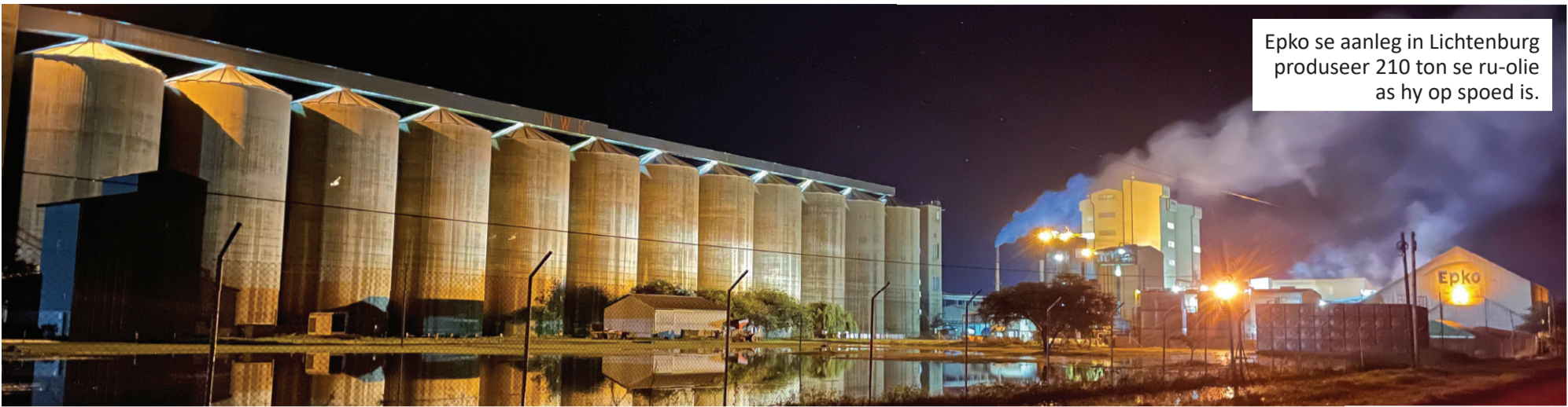
Epko se aanleg in Lichtenburg produseer 210 ton se ru-olie as hy op spoed is.